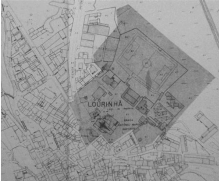
Figure 2. The area that would become the new town centre in the 1970s is highlighted here. Dominated by the town's old soccer field, the area included the old farmers' market. Today, the new square, the Praça José Máximo da Costa , is an open area bounded by the medieval convent (in the map above), a courthouse, a fire hall, a post office, a music academy and the new town hall. The renovation of this space was total.