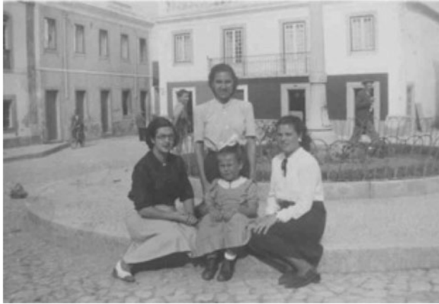
Figure 7. The Praça Marques Pombal, c. 1940. The old square was a cramped parking lot by the time the new one opened in the 1990s.