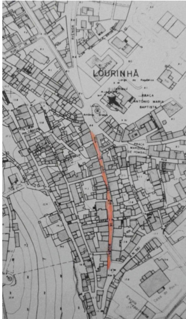
Figure 9. (Colour online) Rua João Luis da Moura has become a pedestrian mall. However, it was the only thoroughway for traffic between the factories and fishing port of Peniche and urban areas to the south, including Lisbon.

Source: Câmara Municipal da Lourinhã, 'Appendix: Arranjo Urbanístico da Rua João Luis de Moura', 15 October 1997. Caixa: Plano Geral de Urbanização da Lourinhã (Arquivo Municipal da Lourinhã, PT).