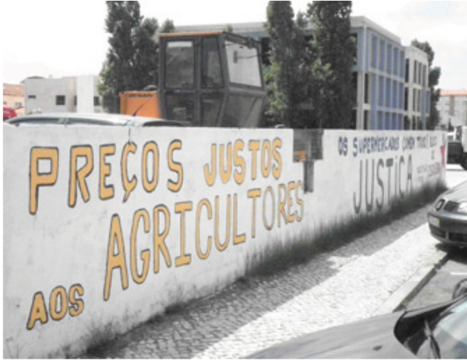
Figure 5. (Colour online) 'Fair prices for farmers'. Although little resistance to Lourinhã's renovation is evident (in fact, locals played an active role in building the town's modern landscape), public space remains a site for protest. The above graffiti, appearing outside Lourinhã's modern market hall in the wake of the financial crisis of the late 2000s, remains there today.