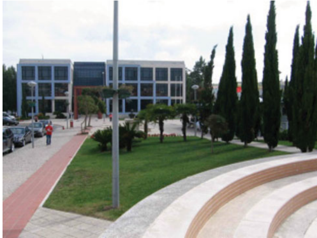
Figure 8. (Colour online) José Máximo da Costa, c. 2008. The new square is open and airy.

a café and a amphitheatre are found in the square), be easily accessible and include trees and other green infrastructure. 82 In 1984 the CML published a ‘General Plan for the Urbanisation of Lourinhã’. Along with the District of Lisbon, the CML felt the need to establish an ‘instrument that would provide the best possible development of urban space in order to achieve equal development’. 83