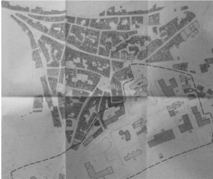
Figure 1. Lourinhã's map in 1979 with the proposed area for development outlined. The contrast in the two landscapes is clear in terms of topographical layout, size and space.