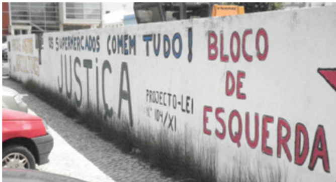
Figure 6. (Colour online) 'Supermarkets eat everything'.