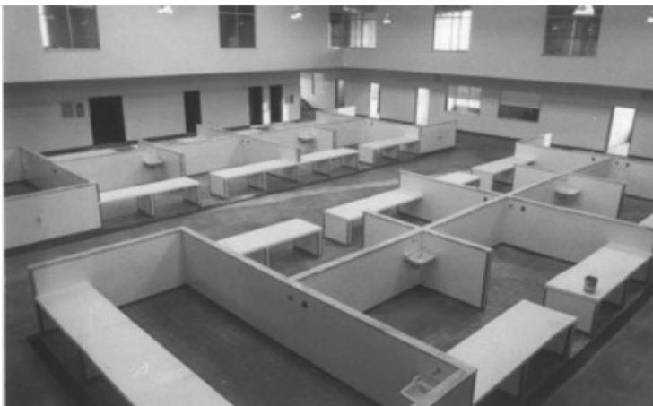
Figure 4. The municipal market shortly before opening in 1989 shows a much more modest and simple plan that, instead of housing some sixty-five stalls and twenty stores, offered twenty stalls and a handful of permanent stores. Today the permanent stores are butchers', cafés and restaurants.