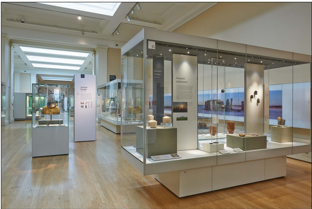
Figure 2. Neolithic and Bronze Age objects on display in Gallery 51 at the British Museum today (photograph © The Trustees of the British Museum. Shared under a Creative Commons Attribution-NonCommercial-ShareAlike 4.0 International (CC BY-NC-SA 4.0) licence).

The resulting icon-oriented approach to display has had significant curatorial consequences. Firstly, while single objects can have many layers of meaning (Cooper et al. 2021: 135–43), they are more limited in what they can convey about complex processes (e.g. an axe displayed simply as a token of lifestyle or identity, rather than as one object of