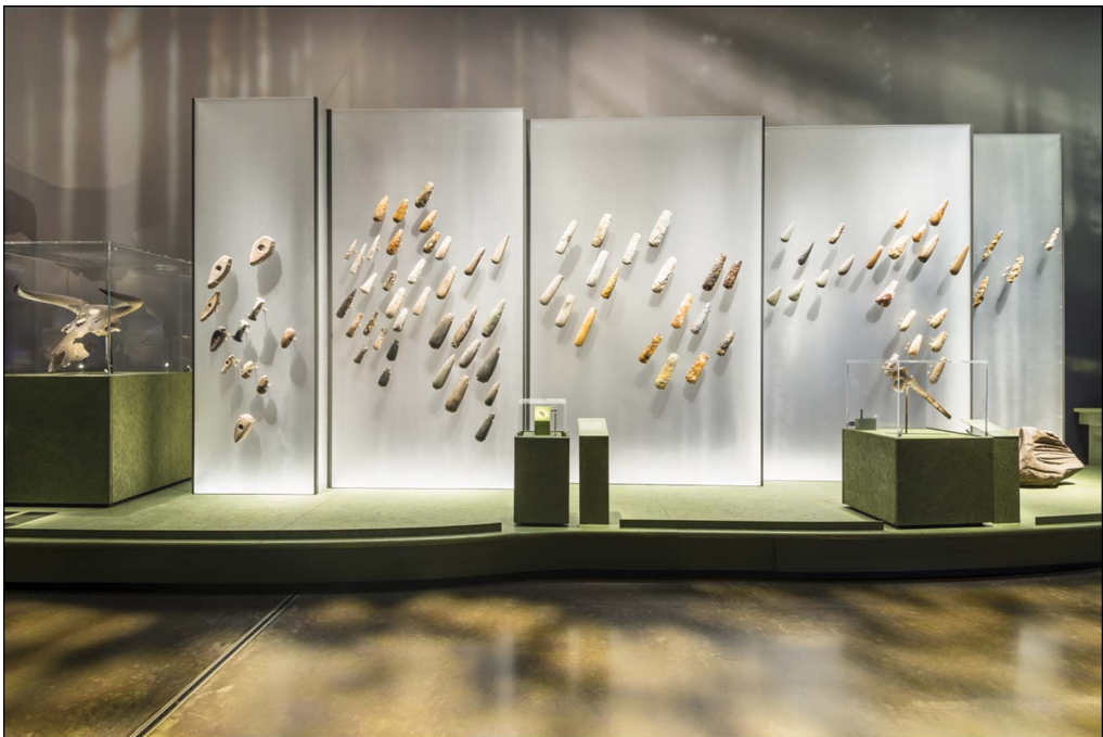
Figure 5. The ‘axe wall’ in the WoS exhibition (photograph © The Trustees of the British Museum. Shared under a Creative Commons Attribution-NonCommercial-ShareAlike 4.0 International (CC BY-NC-SA 4.0) licence).

Although the exhibition narrative of WoS was framed around the rise and fall of Stonehenge, with key objects from the monument and its landscape woven throughout, it also sought to subvert the monument’s iconic status by highlighting other, less famous, contemporary sites. The Early Bronze Age timber monument known as ‘Seahenge’ (Holme-next-the-Sea, Norfolk) was discovered in 1998 (Brennand et al. 2003) (Figure 6).