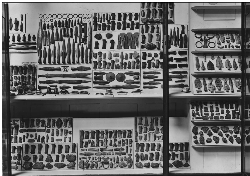
Figure 1. Later prehistoric objects on display in the British Museum in the early twentieth century (photograph © The Trustees of the British Museum. Shared under a Creative Commons Attribution-NonCommercial-ShareAlike 4.0 International (CC BY-NC-SA 4.0) licence).

Recent research on the history of acquisition at the British Museum has shown that finds from archaeological excavations in Britain (primarily England) represent around one-third of the entire collections database, approximately 1.5 million objects (MacDonald 2022: 5). The vast majority of these were excavated and acquired between the 1960s and 1990s, a time of expanding awareness of the analytical and scientific potential of the archaeological record linked to the rise of ‘new archaeology’ (Clarke 1973). Before this, the retention and preservation of archaeological material was far less complete. Most European national museums contain a nucleus of prehistoric objects gathered by nineteenth- and early-twentieth-century antiquarians, archaeologists, collectors and curators (Amkreutz 2020). These collections are typically composed of relatively small, visually striking and durable artefacts perceived to have strong cultural, social or ethnic signification during prehistory. Somewhat paradoxically, between the mid-nineteenth and mid-twentieth centuries there was a policy of near total display of those objects which were in collections in most UK museums (Figure 1). In contrast, from the 1970s onwards there was a process of ‘iconification’ as the most remarkable and extraordinary objects were asked to stand for whole periods and geographies (Figure 2)—an approach that