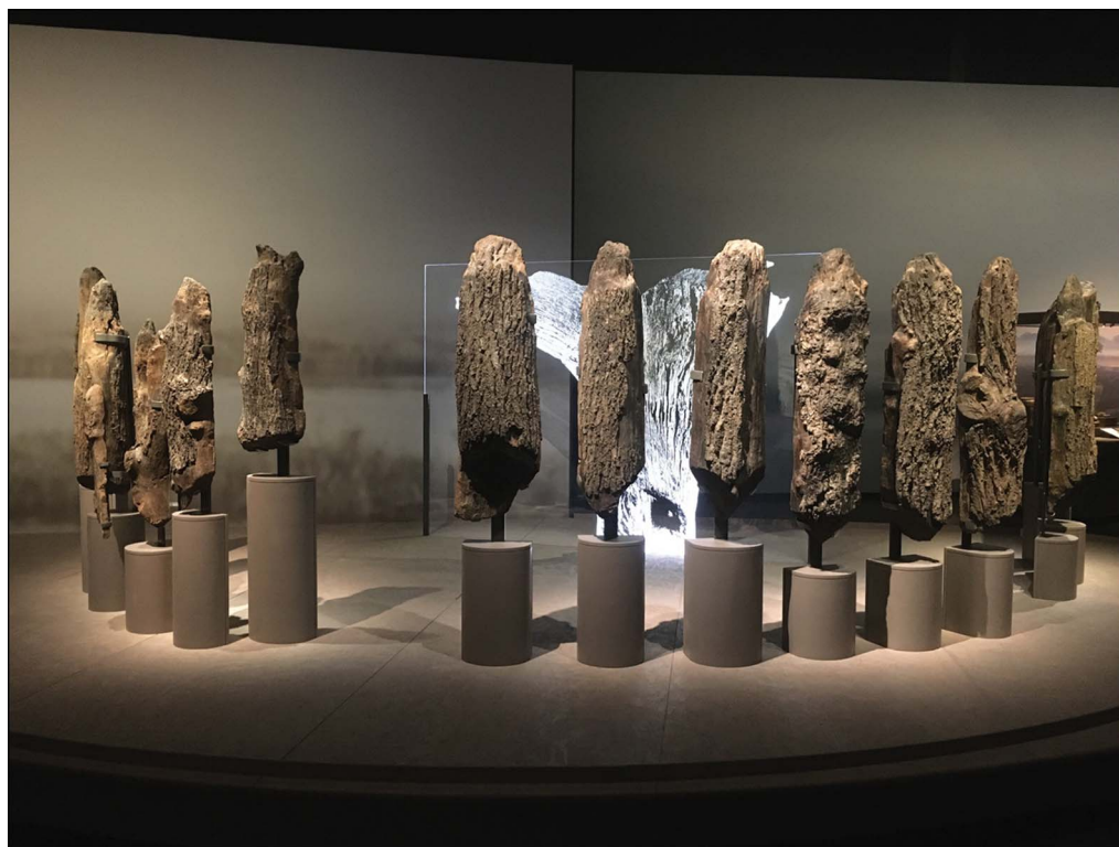
Figure 6. The Seahenge display in the WoS exhibition.

From these reactions we surmise that successful alternative icons are about more than changing approaches to the selection and written interpretation of objects. To offer alternative