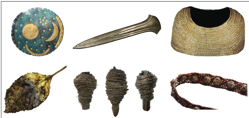
Figure 4. Icons (top row) and alternative icons (bottom row) in the WoS exhibition: Nebra Sky Disc; Oxborough dirk; Mold Gold Cape; Windy Harbour leaf; Must Farm thread on dowels; White Horse Hill cattle hair bracelet with tin studs (note: objects are not to scale).

The first landscape zone (Forest, entitled ‘Working with Nature’) explored the transformations of the British landscape from the start of the Neolithic. A 6000-year-old elm leaf from recent excavations by Oxford Archaeology at Windy Harbour, Lancashire, was presented as an emblem for the fragility of the natural world. Strictly an ecofact (one of many recovered