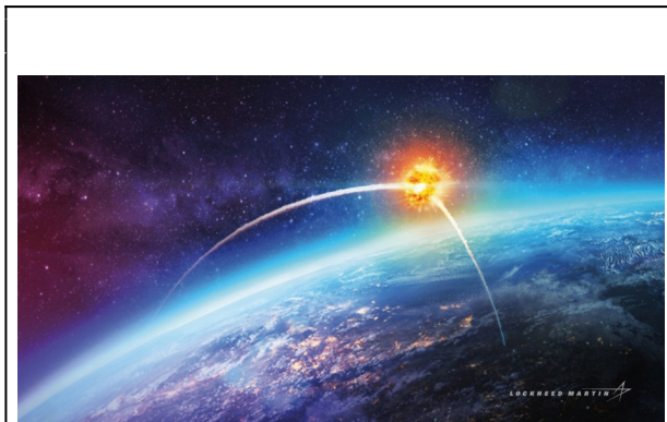
THAAD (Terminal High Altitude Area Defense, Lockheed Martin, “We’re engineering a better tomorrow”

Abstract: This commentary assesses the geopolitical implications for war and peace in Northeast Asia of the Terminal High Altitude Area Defense antimissile system that the US seeks to install in South Korea at a time of deep tensions in Northeast Asia.