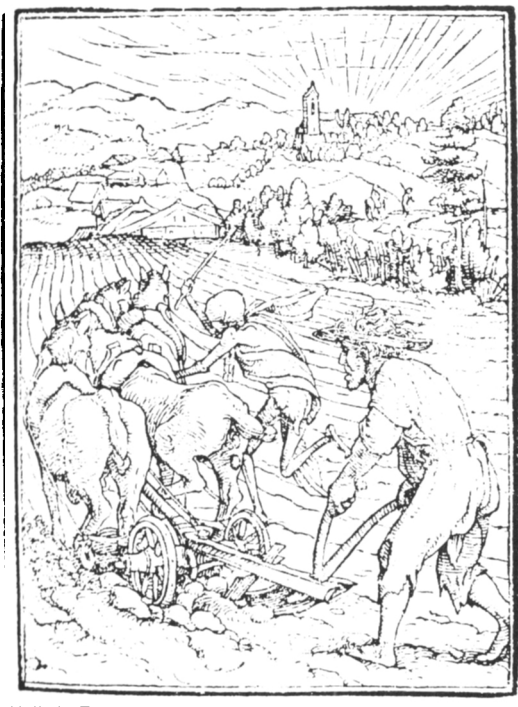
Holbein, The Ploughman From the Dance of Death, 1522-25