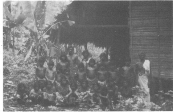
A group of Kadar—a semi-nomadic hill forest people who are familiar with Heosemys silvatica as part of their diet.