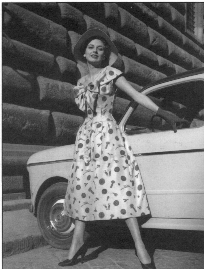
A model wearing a dress designed by the Italian atelier Carosa, 1955