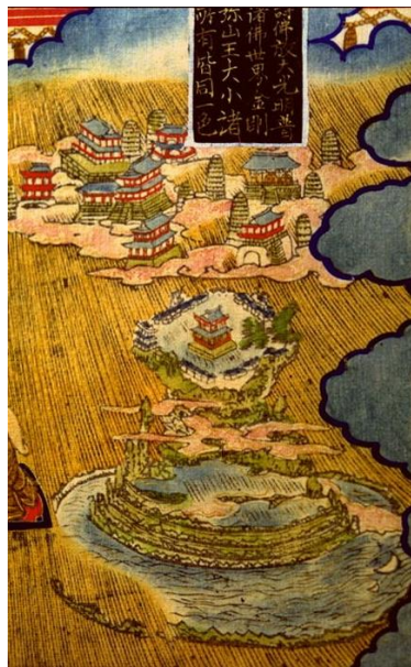
Mount Sumeru and other mountains illuminated by Amidha's light

Miyazawa Kenji's story "Indra's Net," in title and content, calls forth one of the most appealing visual references in Buddhism. Indra, sitting in his palace atop Mt. Meru (Sumeru in Buddhism, a mythical abode of deities, buddhas and bodhisattvas), unfurls a net above himself in the endless, empty, radiant sky. In the eye of each connection of the net hangs a jewel, and each jewel has countless facets. A brilliant sun illuminates the net, and each facet of each jewel reflects in it all the other jewels and all their facets. The image is one of radiance, of endless reproduction of reality, of interpenetration, of visual and imaginative emergence. It is also grandiose and clearly challenges our usual intellect and imagination as we try to grasp each facet containing the entirety of the rest of the field of refractions within it. Everything is as real as light.