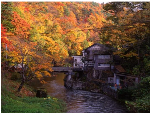
Osawa Onsen just outside Hanamaki. Kenji often went to the rotenburo (outdoor

How did this man, born into a well-to-do entrepreneurial family in the provincial Iwate Prefecture town of Hanamaki at the end of the 19th century, come to envision himself in such a remote spot, ecstatic at the floor of heaven?