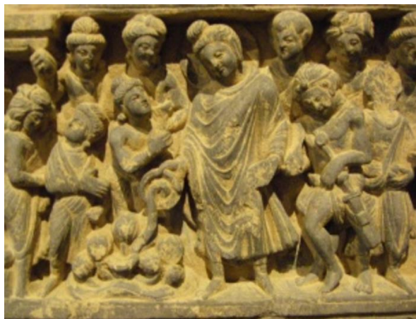
Buddha subdues the serpent and converts onlookers. Gandhara 2nd-3rd century

Suddenly I saw three heavenly children before me. They wore the thinnest robes, woven, it seemed, from frost, and transparent shoes, standing on the water’s edge, peering intently into the eastern sky, as if waiting for the sun to rise. The eastern sky was already alight with whiteness. From the folds in their robes I could tell they were from Gandhara. I recognized them as being from a fresco that I had excavated at the ruins of the great Khotan Temple. I approached them quietly and greeted them in a very low voice, so as not to frighten them.