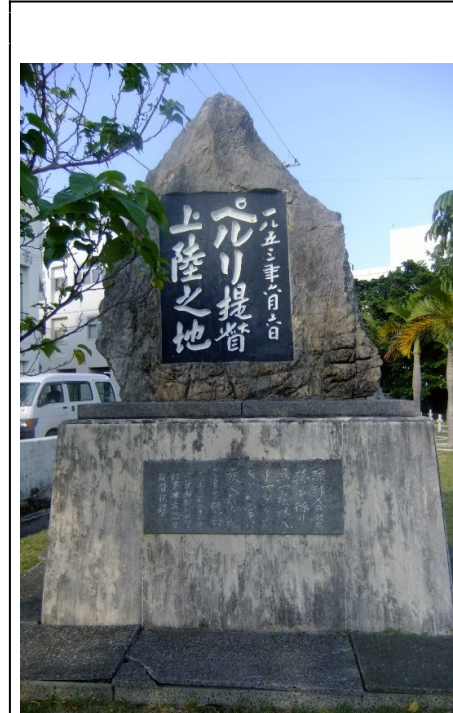
Memorial to Perry’s arrival in Okinawa

Today, in addition to their exemption from key provisions of Japanese law, uniformed members of the U.S. military and its civilian employees enjoy the extraterritorial privileges as well as free housing and reduced-price shopping on the vast American bases. They can send their children tuition-free to American schools and use the generous recreation and entertainment facilities on base. In 1853-54, Perry euphemistically called his gunboat intrusions on Japan and Ryukyu an “Expedition.” Today, the Marines describe their Okinawa-based division in colonial terms as an “Expeditionary Force.”