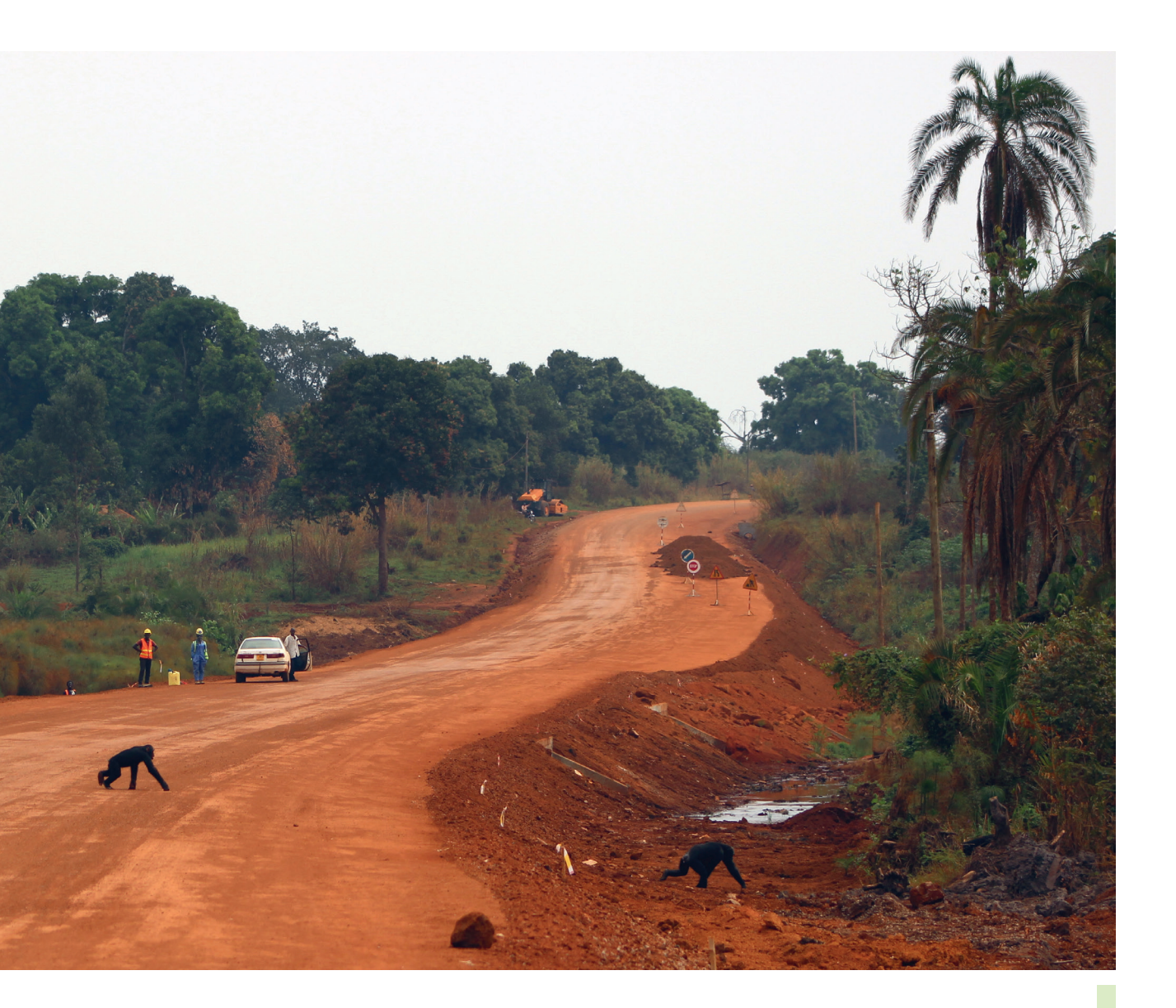
Photo: Historically, wild apes have shared their natural environment with various wildlife species and their associated pathogens, but had limited contact with humans until the current age. Now, many wild apes live in habitats that are subject to different degrees of anthropogenic encroachment. Chimpanzees crossing a road in Bulindi, Uganda. © Jacqueline Rohen

IPCC, 2023). Ecosystems are struggling to cope with continued and cumulative stresses. All the while, deforestation, encroachment into natural habitat and other human activities are driving an increase in the frequency of interactions between people and various forms of wildlife, including viruses, parasites, bacteria and fungi (Nellemann and Newton, 2002). The consequence is a heightened risk of disease transmission, with serious implications for conservation, biodiversity protection and human health (Balasubramaniam