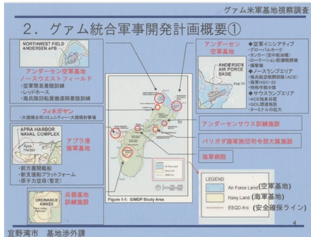
A Map of Guam from the Guam Integrated Military Development Plan, translated and analyzed by Ginowan City

This plan has been around for three years. Now the environmental assessment has been done and the Environmental Impact Statement issued. Once revised in accord with opinions received, the plan will, if approved, then be implemented. Approval is anticipated by July 30, 2010.