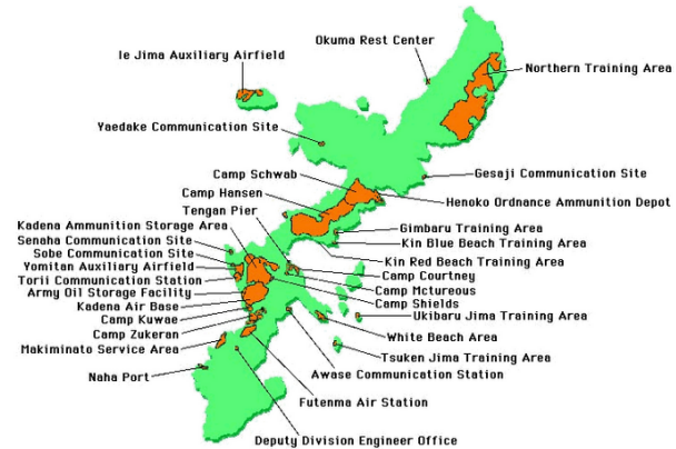
U.S. Military Facilities on the main island of Okinawa

unacceptable. This is the greatest opposition, and this is why relocation within the prefecture has been opposed so strongly