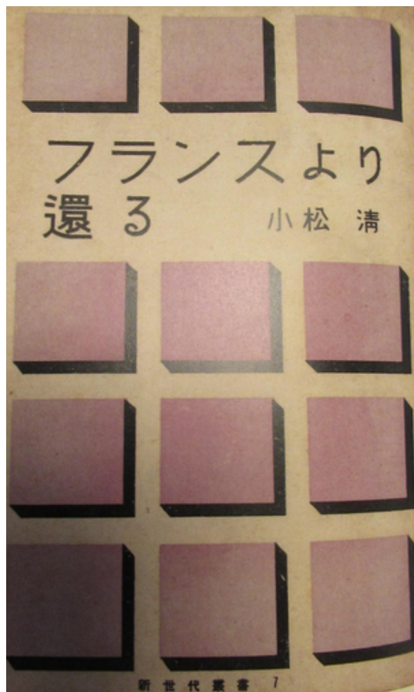
フランスより還る (育生社), Furansu yori kaeru (Return from France), 1941.