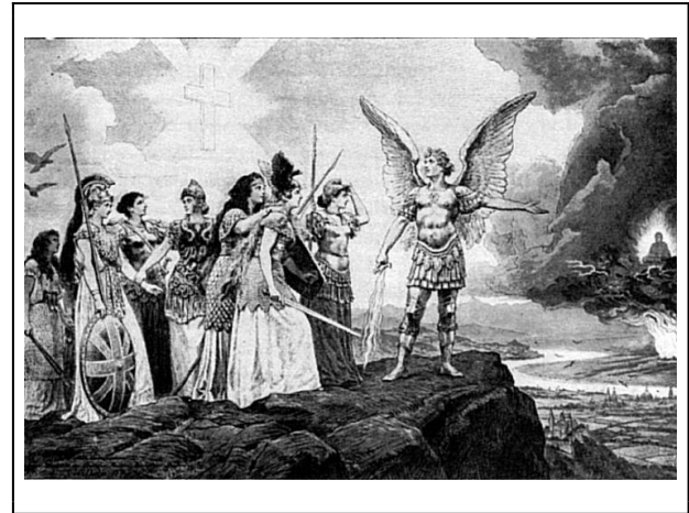
Fig. 1. Völker Europas wahret eure heiligsten Güter (‘People of Europe, Protect Your Most Sacred Goods’ aka ‘The Yellow Peril’). Hermann Knackfuss, 1895. Represented as the defenders of Christendom are France, Germany, Russia, Austria, Italy, and Great Britain.

Many of these people understood the conflict as being not merely strategic and geopolitical but civilizational in nature. As Shimazu puts it, ‘the war fueled the imagination of international contemporaries, representing many iconic clashes: the West versus East, Europe versus Asia, Christian versus “heathens”, tradition versus modern, and the white race versus the yellow race’ (Shimazu 2009:1). Perhaps the most striking visual representation of this outlook is Hermann Knackfuss’s famous 1895 lithograph Völker Europas wahret eure heiligsten Güter , known in English as ‘The Yellow Peril’ (Fig.1).