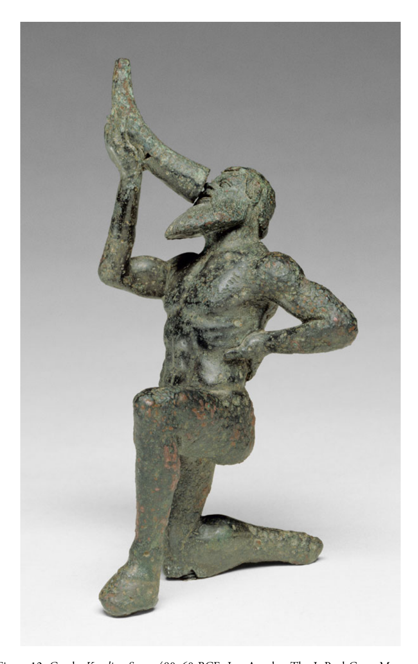
Figure 12. Greek. Kneeling Satyr . 480–60 BCE. Los Angeles, The J. Paul Getty Museum.