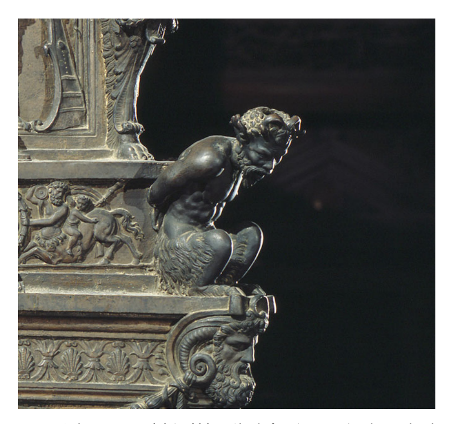
Figure 5. Andrea Riccio. Paschal Candelabrum (detail of satyr). 1507–16. Padua, Basilica di Sant'Antonio.

presaged Riccio's capacity to outstrip other sculptors through independent bronze statuettes, a genre in which Donatello reputedly never worked.<sup>61</sup>