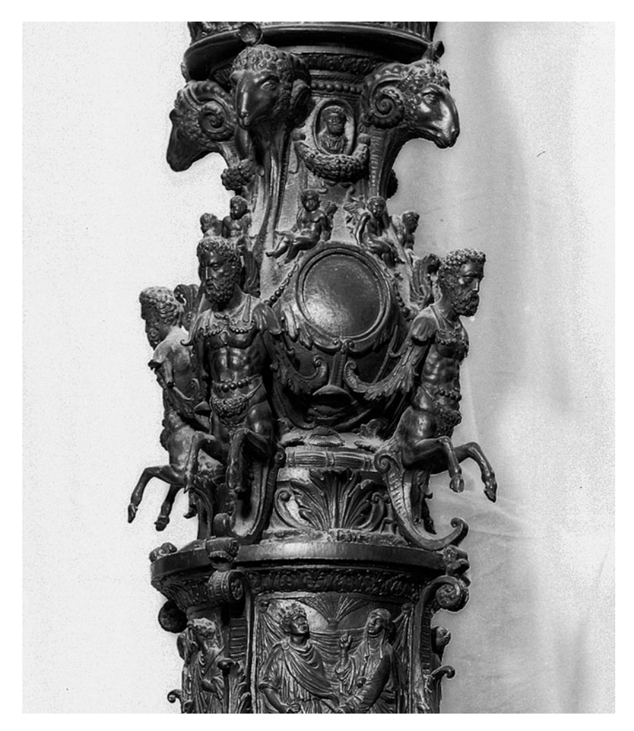
Figure 4. Andrea Riccio. Paschal Candelabrum (detail of centaurs). 1507–16. Padua, Basilica di Sant'Antonio.

conceived by a local artist, Riccio's Candelabrum upheld Paduan honor in the aftermath of a war led by condottieri . The cannon-like form of the Candelabrum would have resonated with the conspicuous cannonball under the front hoof of Gattamelata's horse, a bellicose detail that guaranteed four contact points for stability. Riccio's Candelabrum also alluded to the Gattamelata through four protruding centaurs with unfettered hooves (fig. 4), creatively transmogrifying the Gattamelata 's equestrian components into hybrid miniatures. Such details