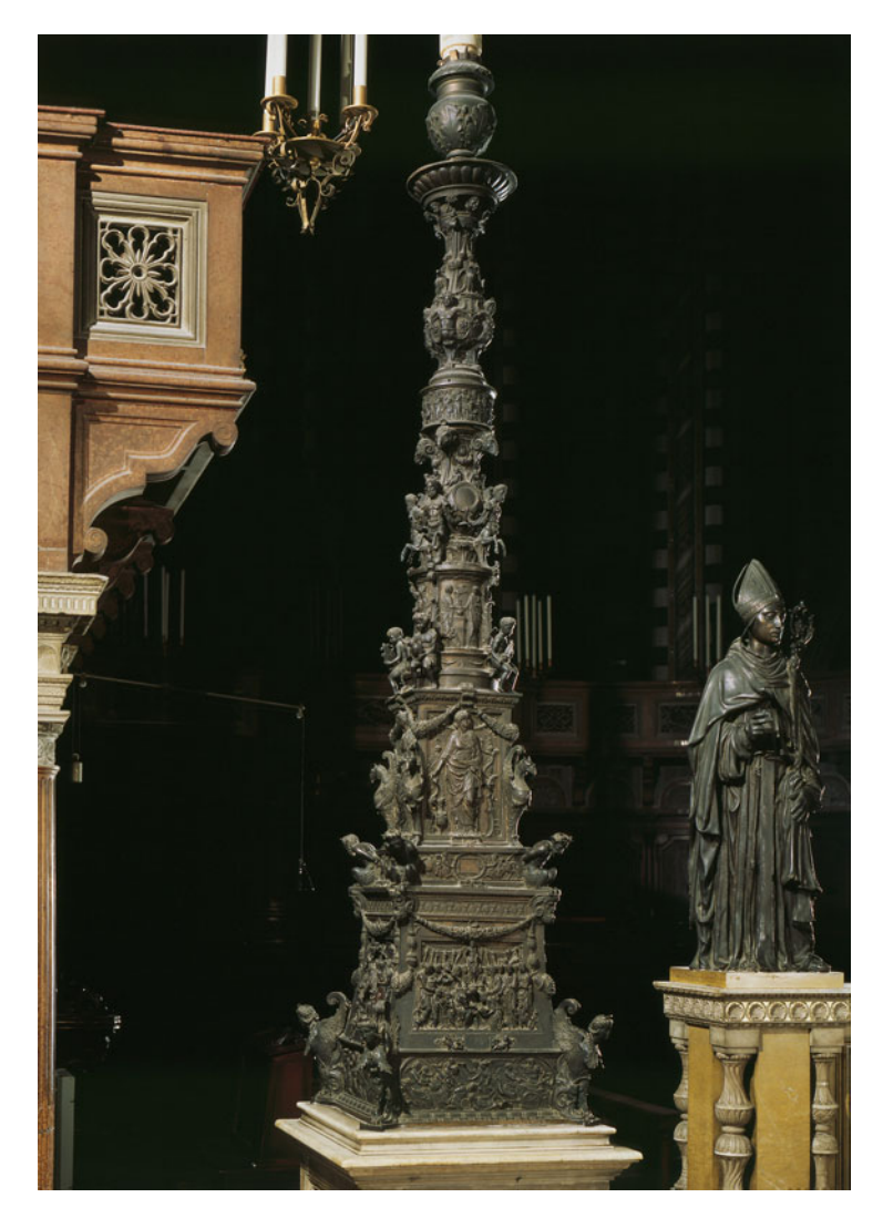
Figure 1. Andrea Riccio. Paschal Candelabrum . 1507–16. Padua, Basilica di Sant'Antonio.

The subsequent scenes of La Pastoral responded by giving voice to multiple vernacular dialects through characters who confronted acute suffering in the aftermath of the bloodshed.