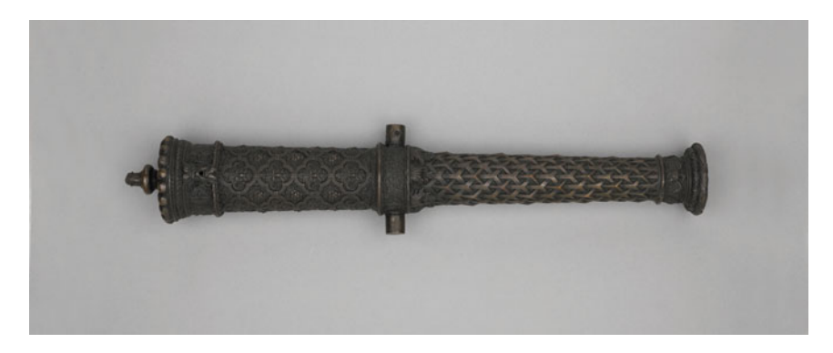
Figure 2. Giovanni da Sant'Ursula (designed); Vincenzo Grandi (possibly modeled and cast). Culverin Cannon . 1577. London, The Wallace Collection.

countryside inhabited by Pan and his retinue contrasted with the city's surroundings, riven by war and freshly demarcated along property lines. <sup>41</sup> Pan was no pacifist, however: his trademark panic not only inspired intellectual ecstasy, but it also represented martial disorder historically exploited by tacticians. <sup>42</sup> Indeed, Pan's bellicosity could be channeled into bronze, as in a sixteenth-century Paduan culverin cannon with a satyr-like mask for its vent (fig. 2). <sup>43</sup> When Riccio rendered a caprine man into a bronze statuette, material and subject were redirected toward peaceful aims. His artisanry implicitly recast the biblical adage of swords to plowshares as cannons to statues.