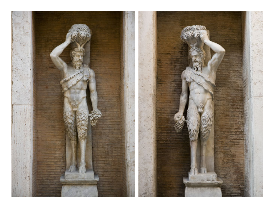
Figure 13. Roman. Della Valle Satyrs . 2nd century CE. Rome, Capitoline Museums.

designs forced practical concerns about the functions of their vessels when writing, reading, and socializing. <sup>81</sup> Isolated from a clear narrative context, Riccio's satyrs could redirect the obstreperous, provocative connotations of these pastoral characters into the similarly disruptive realm of contemporary dialect literature that traversed oral and written communication, as Riccio would have known through La Pastoral . <sup>82</sup>