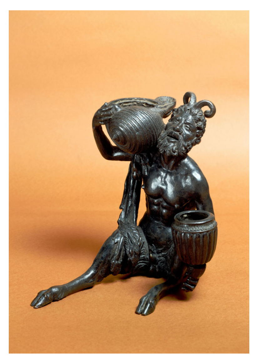
Figure 7. Andrea Riccio. Seated Satyr. 1520s. Florence, Museo Nazionale del Bargello.

what is meant by objects' "use" and "function," showing how these properties are not singularly fixed but, rather, conceptually generous in revealing a history of use itself.<sup>71</sup> Through creative poses that featured quotidian interactions with