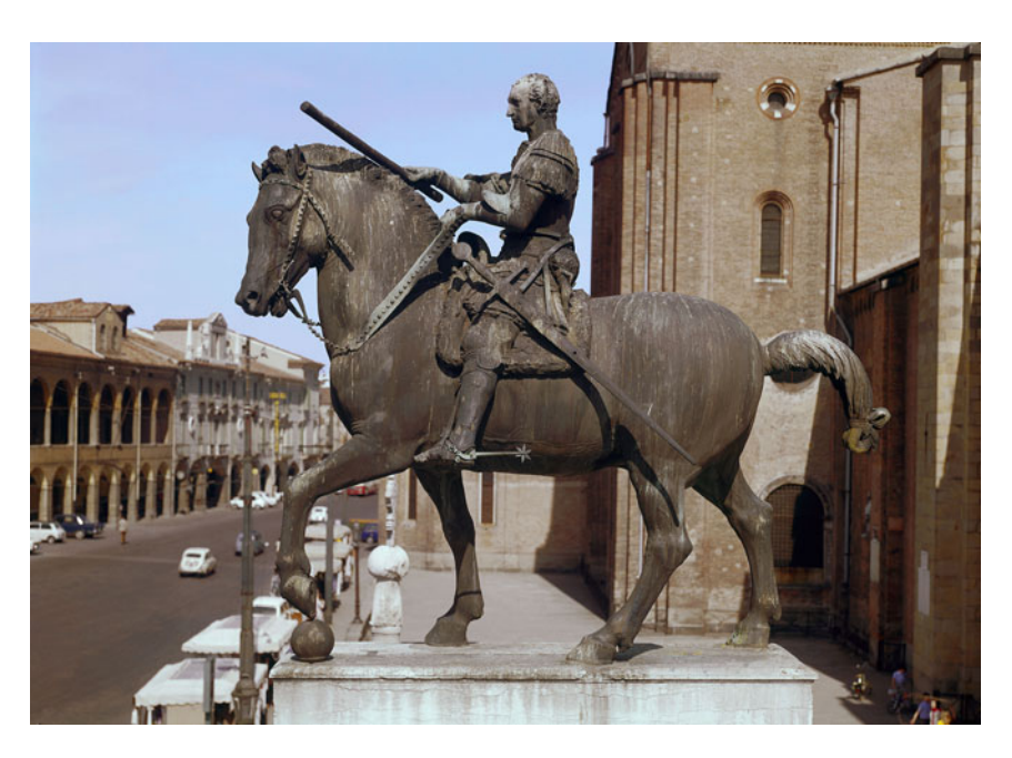
Figure 3. Donatello. Equestrian Statue of Gattamelata . 1447–53. Padua, Piazza del Santo.

the Santo's account books lauded its design and manufacture in relation to its martial disturbances.<sup>57</sup> The entry related these features of the Candelabrum to the glory of Padua, indicative of the civic associations of the Santo, where it was installed.<sup>58</sup>