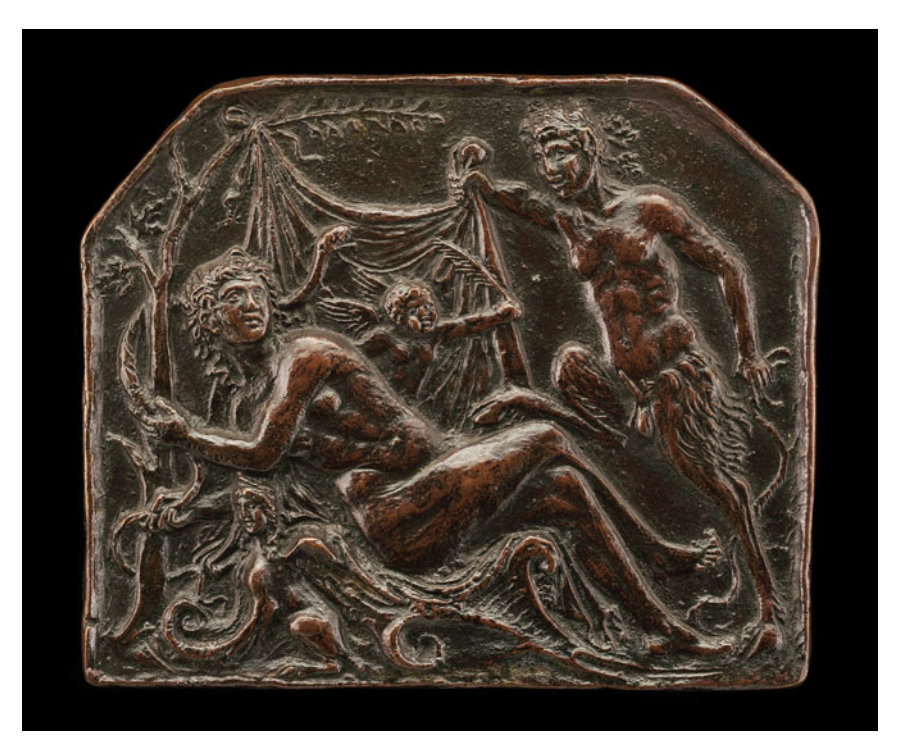
Figure 16. Andrea Riccio. Satyr Uncovering a Nymph . Ca. 1500–10. Washington, DC, National Gallery of Art.

Altering sexual possibilities by separating bronze satyrs from multi-figure narratives, Riccio co-opted a technique used by the Mantuan court sculptor Antico, who cast a bronze statuette of Pan without his beloved young male shepherd Daphnis, despite the latter's presence in the antique marble group he was copying (fig. 10). While Antico's bronze had obscured this classical subject's same-sex desires by rendering Pan solitary, Riccio turned this strategy on its head through satyr statuettes that could direct their libidinous overtures to any beloved. Riccio's satyr statuettes' vessels could themselves become erotically charged, recalling a frottola in Magno's other manuscript that used pavano dialect to celebrate the sexual allusions of household items used as containers. 149