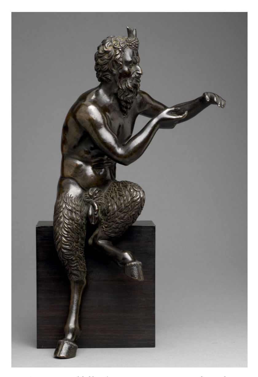
Figure 10. Antico. Pan. Modeled by 1499, cast ca. 1519. Vienna, Kunsthistorisches Museum.