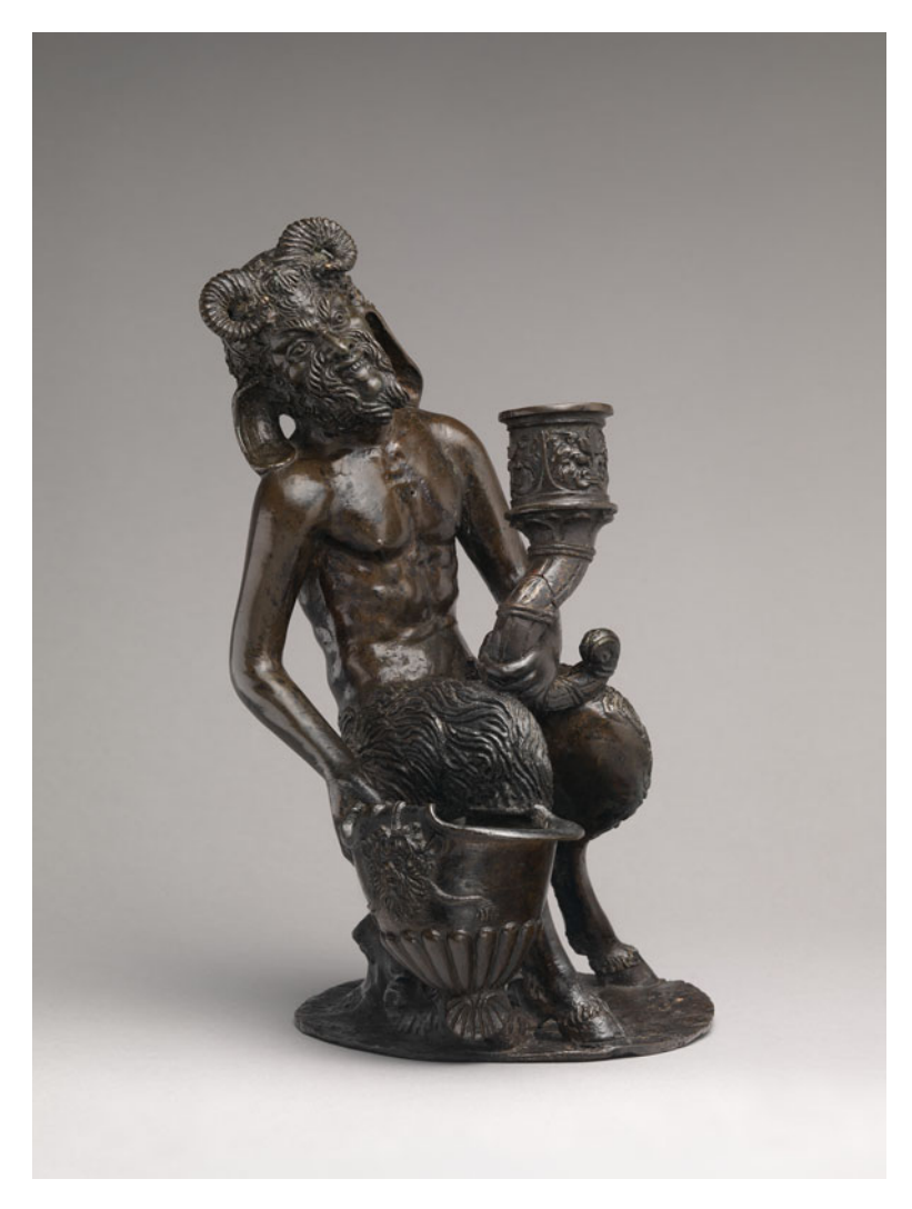
Figure 17. Paduan. Seated Satyr . Mid-sixteenth century. New York, The Metropolitan Museum of Art. The Jack and Belle Linsky Collection, 1982.

Riccio's Bargello Seated Satyr are perched on tree stumps and splayed on the ground, often accommodating an inkwell and candleholder.<sup>155</sup> In a representative version (fig. 17), the satyr bares its teeth and tongue while grimacing, a feral expression evoking a brutishness that Riccio had strained