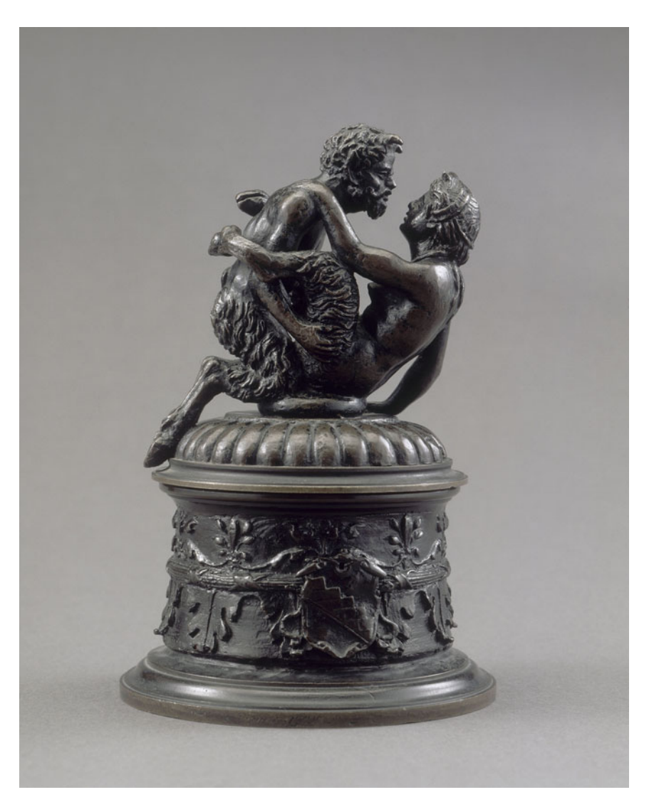
Figure 18. Follower of Riccio. Satyr and Satyress. Mid-sixteenth century. Paris, Musée du Louvre.

to humanize. Such a bronze signals how, as the sixteenth century wore on, satyrs were increasingly explored visually through their bestial nature rather than their multivalent potential. If Riccio recognized the dense possibilities afforded by satyrs' lustful reputation, subsequent bronzes were often unequivocal in depicting consistently male-female eroticism, exemplified by a copulating Satyr and Satyress that served as a container lid (fig. 18). Bronze