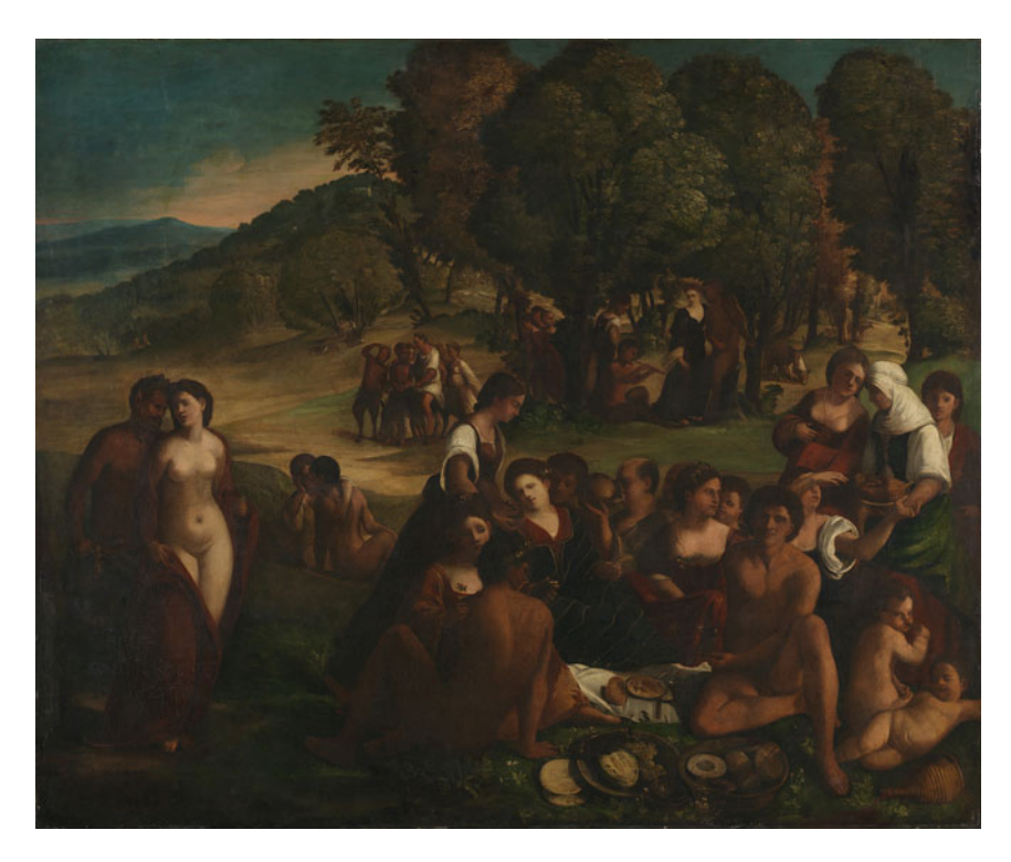
Figure 14. Dosso Dossi (workshop). Bacchanal . Ca. 1525. London, The National Gallery.

with La Pastoral in mind, but, rather, that it partook in a shared Paduan literary culture that generated entertainment from the aftermath of conflict.