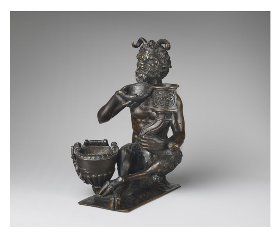
Figure 19. Paduan. Seated Satyr . Mid- to late sixteenth century. New York, The Frick Collection. Copyright The Frick Collection.

of Ruzante as a character speaking elegant Tuscan in a later dialogue of his. 163 Plurilingual literature survived the questione della lingua in various forms, 164 but Padua's growing prominence in standardizing vernacular language harmonized with the standardized designs of bronze statuettes that occupied the desks of those debating it. 165 This is exemplified by a schematic sixteenth-century bronze satyr with an inkwell, bowl, and candleholder that bears the coat of arms of the noble Paduan Capodivacca family (fig. 19). 166 While it is not possible to individuate who commissioned this bronze, at least one member of the family in this period—Francesco—had documented ties with the Accademia degli Infiammati. 167 Benignly offering ink to its high-born owner,