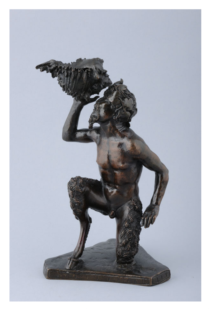
Figure 11. Severo da Ravenna. Kneeling Satyr. Ca. 1500–10. Rome, Museo Nazionale del Palazzo di Venezia.

bacchic activities is sublimated to its owner's needs for an inkwell or oil lamp. While scholars have associated Riccio's satyr statuettes with intellectual traditions including Aristotelianism, natural mythology, and alchemy, their humanized