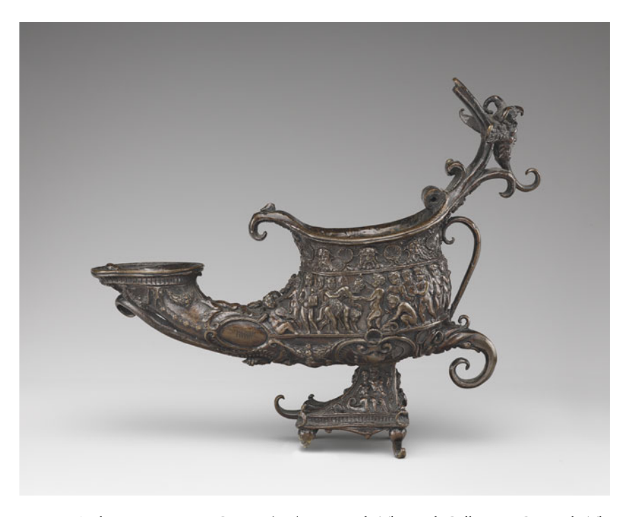
Figure 9. Andrea Riccio. Lamp. Ca. 1516–24. New York, The Frick Collection.

Antico miniaturized numerous ancient sculptures into small bronzes without functional attributes (fig. 10).<sup>72</sup> If Riccio's bronzes carried plurilingual utility through their usefulness for textual activities and evocation of multiple linguistic traditions, a satyr like that by Antico did the opposite, summoning a singularly classical lexicon while concentrating use on purely aesthetic and tactile dimensions. Such differences also emerged through facture: the meticulous smoothness of Antico's bronzes spoke a lustrous, uniformly antique vocabulary, whereas Riccio's satyr statuettes juxtaposed polished surfaces with rough, ball-peenhammered passages and unchased hair and facial features. In Padua, this multiplicity of textures in Riccio's bronzes could evoke coarse local dialects confronting the burnished Tuscan literary vernacular, as in La Pastoral .