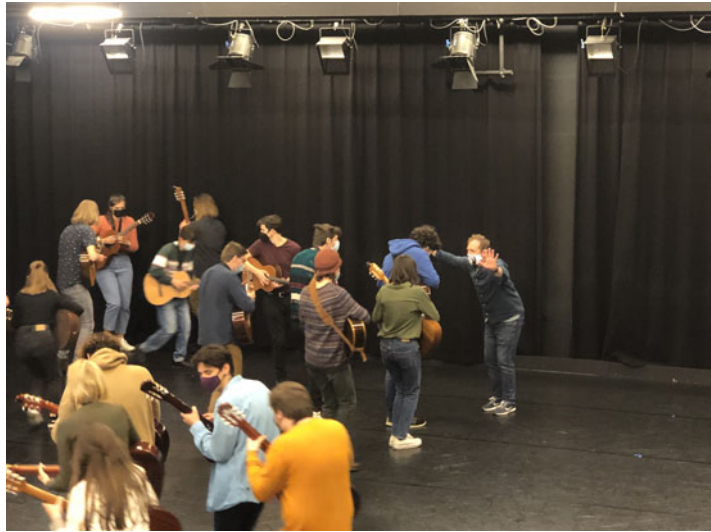
Figure 3: Rehearsing six to five .