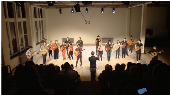
Figure 4: RCA Guitar Ensemble performing six to five at Transit Festival Leuven 2021.

room on the [their] back 24 and channel that energy for the musicians.