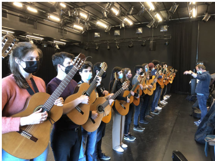
Figure 2: Workshopping six to five .

The workshops themselves contained very specific ideas, both guitar techniques and movement-based, that Marino wanted to try out with the ensemble. She relied on Couck to assist with guitar