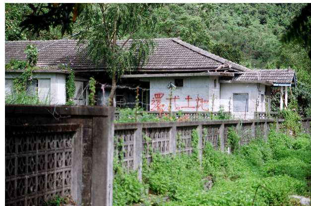
Return our land

military expeditions, including the electric fences, Japanese artillery, and Taroko people resisting with simple hunting guns. Many of the photos were taken from memorabilia albums sold in Japan at the time to celebrate the victory. The final panel of the exhibit, a drawing of the sun setting over the mountains, brought the issue of resistance to contemporary Taiwan. The text said that the Taroko came down from the mountains, saw their land occupied by outsiders, and “have not yet been able to return to their ancestral lands.” Putting it into context, museum visitors could recognize that the arrival of the Republic of China and later the establishment of the Taroko National Park were precisely extensions of imperial conquest, the replacement of one colonial overlord with another. This written discourse repeated Taroko activist Tera Yudaw’s contention that the Taroko National Park is a form of “environmental colonialism” (Tera 2003: 169).