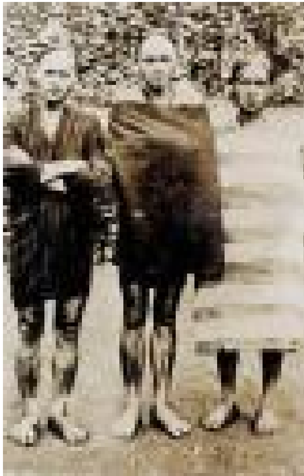
Mona Rudao center

In the months leading up to the local elections in December, 2005, the KMT continued to appropriate indigenous social memory by covering their headquarters in Taipei with a large image of Wushe hero Mona Rudao. This tactic has the twin effect of appealing to Mainlander anti-Japanese sentiments and of positioning the KMT as the voice of indigenous peoples. The party's consistent support in indigenous areas, including overwhelming support in the December 2005 local elections, suggests that this strategy has contributed to electoral success. May Chin's protests are only a part of this larger struggle.