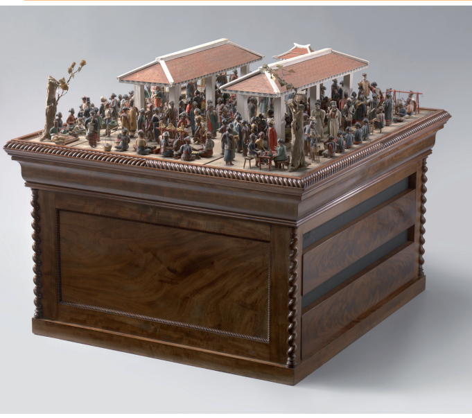
Javanese market, c. 1830–1860, anonymous. Model of a double market gallery consisting of Javanese pendopo pillars and Dutch roof tiles. intended as souvenir for European travelers. Courtesy of the Rijksmuseum, Amsterdam, object NG-2009-134.

Itinerario , founded in 1977, offers a publishing platform for research on the history of European Expansion in both its Western and Non-Western contexts, and its impact on World History in general.