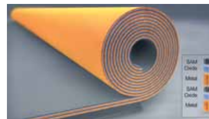
Self-rolled nanomembrane supercapacitor showing the hybrid layer sequence of self-assembled monolayer-oxide-metal. Reproduced with permission from Nano Lett. 10 (7) (2010) DOI: 10.1021/nl1010367; p. 2506.

p. 2506), the research team deposited strained multilayered nanomembranes by sequential depositions of metal and dielectric thin films on a sacrificial layer. Selective etching of the sacrificial layer initiated self-rolling of the nanomembranes into cylinders. The compactness of the cylinders was reproducibly tuned by careful control of the processing parameters. Hundreds of self-rolled cylinders can be prepared in parallel on a single chip which can be reused repeatedly. Furthermore, the research team demonstrated that organic monolayers may be introduced in the inorganic films of the nanomembranes to reduce leakage currents. In addition, these organic monolayers could be potentially leveraged for biological and chemical functionalization of these electronic elements with organic molecules. This self-rolling process can occur in aqueous media at physiological pH and is thus compatible for incorporation of biomolecules.