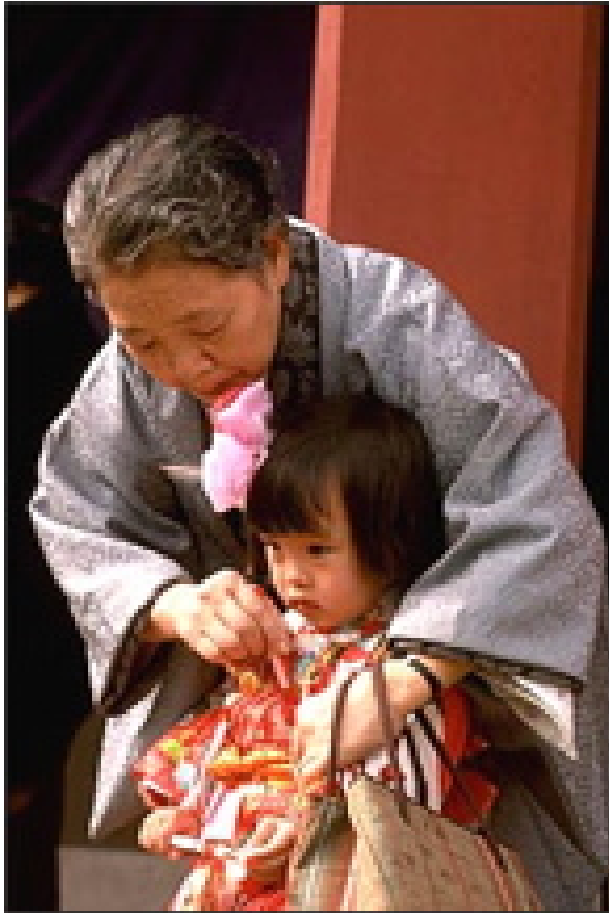
The proportion of elderly in Japan is rapidly increasing

Economic factors are most often cited as the primary reason more and more Japanese get married in later life or choose - or are even forced to choose - to remain single. Working women find it particularly difficult to combine employment and child-rearing because of the poor quality of child-care services available, unfavorable employment practices, and rigid working conditions.