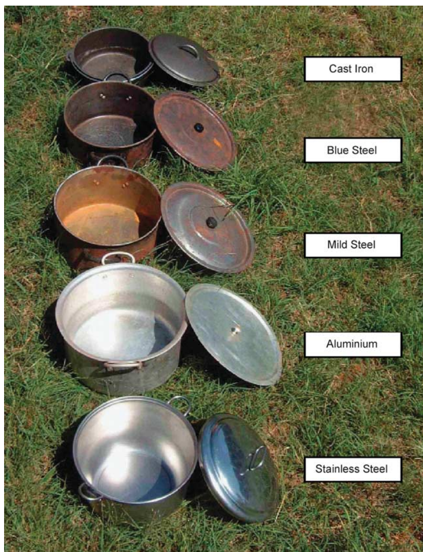
Fig. 1 A selection of iron and iron-alloy cooking pots after use in the pre-trial evaluation and the stainless steel pot (bottom), which was distributed in the intervention trial. Different sizes are shown: 5-litre cast iron and stainless steel, and 7-litre blue steel, mild steel and aluminium cooking pots. The treated blue steel cooking pot is similar in appearance to the blue steel pot and is not shown in this photograph

handle. The pot was intended for cooking beans, peas and other legumes for families of one to ten persons. Cooking pots already in use in households in the camp (aluminium or locally made clay pots) were not removed.