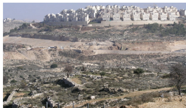
Israeli settlements in the West Bank designated for development funding in December 2009

harder." United Nations Secretary-General Ban Ki-moon reacted to Gilo by affirming "his position that settlements are illegal, and calls on Israel to respect its commitments under the Road Map [a peace plan that foresees two Israel and Palestine states living side by side in peace and security] to cease all settlement activity, including natural growth." The current Swedish president of the European Union stressed that the EU's position is that "settlement activities, house demolitions and evictions in East Jerusalem are illegal under international law." Importantly, the president also noted that "such activities... threaten the viability of a two-state solution" and that the EU "has never recognized the annexation of East Jerusalem in 1967 nor the subsequent 1980 basic law," in which Israel claimed Jerusalem, including the occupied eastern half, as its "undivided" capital.