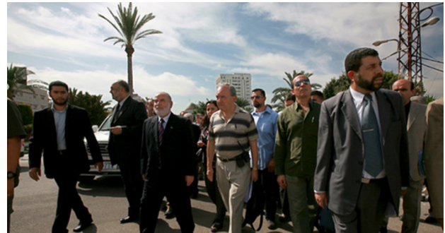
Richard Goldstone (in short-sleeve shirt), Head of the UN Fact Finding Mission on the Gaza Conflict, which produced the September 25, 2009 "Goldstone Report"

It seems clear that with Israel-Palestinian negotiations long stalled, while Israel continues its inexorable building and consolidation of illegal settlements, that the Japanese diplomatic position, if it is a serious one, requires a focus on the positive steps the world community can take (such as the Javier Solana proposal) to finally implement 242.