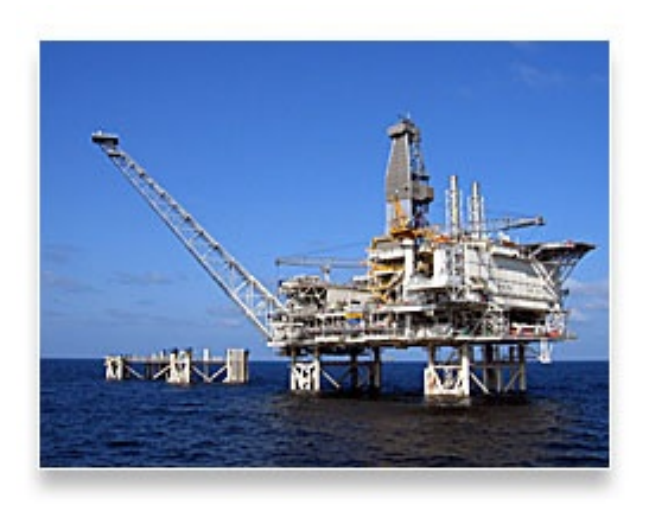
ACG Oil Project in Azerbaijan

Among other projects in the region, Japan's Itochu Oil Exploration and Inpex have a 3.92% interest and 10% interest, respectively, in a production-sharing agreement (PSA) for three fields in the South Caspian Sea. The Azeri-Chirag-Guneshli (ACG) fields are located approximately 120 km southeast of Baku in Azerbaijan. The Japanese government-backed Inpex also has an 8.33% interest in the Kashagan oilfield in Kazakhstan.