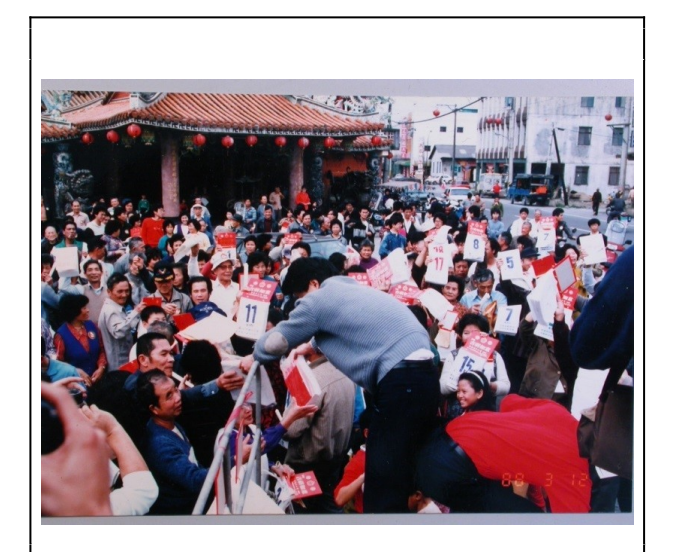
YASA collecting Taipower calendars, March 1988, by Liao Ming-hsiung, collected by Wu Wen-tung

The event was remembered as their "declaration of war" against the state's nuclear power policy.<sup>21</sup>