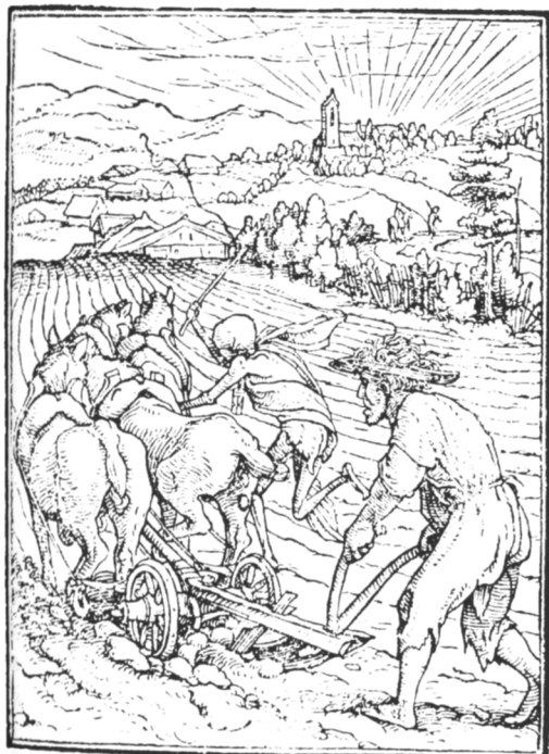
Holbein, The Ploughman From the Dance of Death, 1522-25