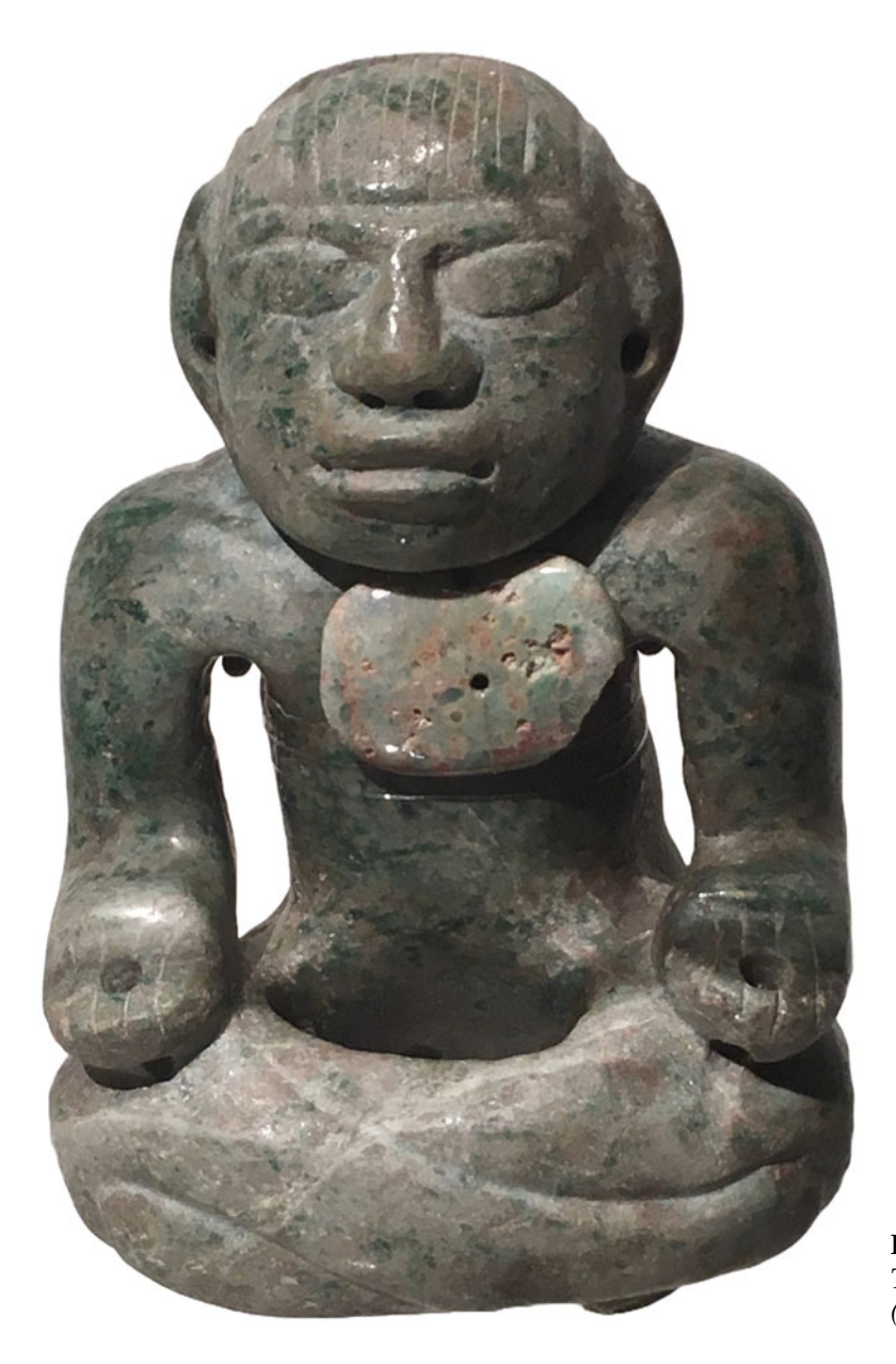
Figure 7. A jade mirror bearer, Burial 5, Temple of the Moon, Teotihuacan.

a catalyst for others. In this same interval, older forms of architecture at Tikal were successively burned, buried and razed before, in approximately 250 CE, Teotihuacan-style architecture appeared at the site. Pachuca obsidian also appeared in quantity at Maya sites for the first time. This pattern suggests that Teotihuacanos likely interacted with elite residents of Tikal during that century when the office of ajaw in its Classic manifestation began to take form.