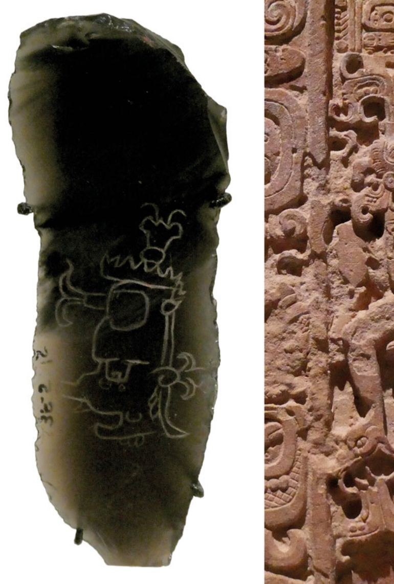
and royal dynasties. (Left) obsidian flake incised with an image of availadu.