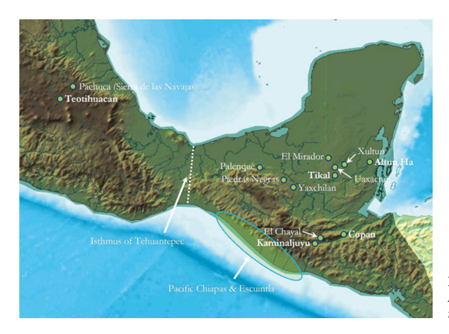
Figure 1. Map of central and eastern Mesoamerica marked with sites mentioned in the text.

'shouters' or 'proclaimers' (Martin 2020, 69; Stuart 1995, 190–91).