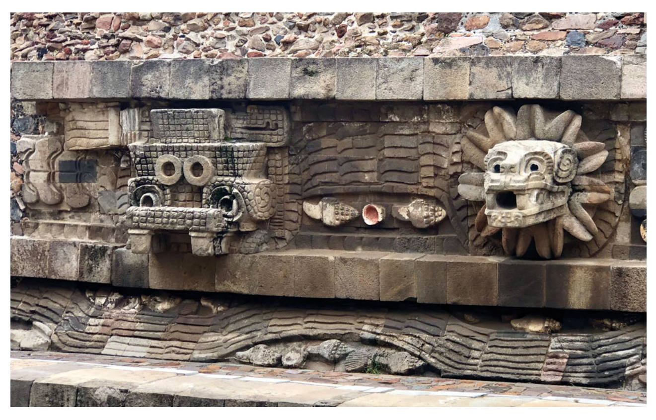
Figure 2. Tenon heads of the Pyramid of the Feathered Serpent, Teotihuacan.

that cohered with the building of Teotihuacan's Temple of the Feathered Serpent. These findings suggest that the ajawtaak occupied a unique positionality in Early Classic Mesoamerican society that was neither essentially Teotihuacan nor essentially Maya, but a dynamic syncretism of the two ethnicities that was indispensable for the refinement of indigenous Mesoamerican understandings of each.