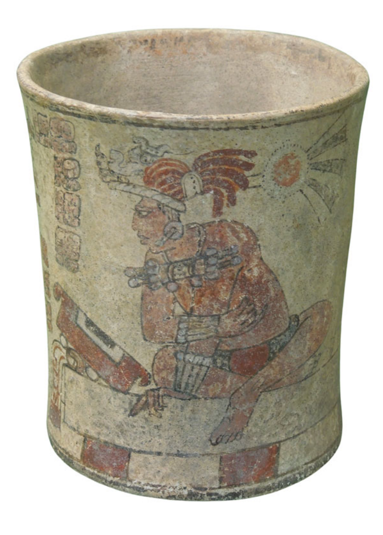
Figure 6. A Maya lord peers into an obsidian mirror on a Late Classic Maya polychrome vessel, Kaminaljuyu, Museo Miraflores, Guatemala.

acknowledgement of the 'law of superposition', the reality that within a series of sedimented layers, those layers nearest to the surface are most readably available to observation. Nonetheless, the PTP engaged in extensive trenching, often to the level of unmodified earth, and changes to the accumulation of obsidian in Tikal's archaeological record on this scale are unlikely to reflect this principle alone.