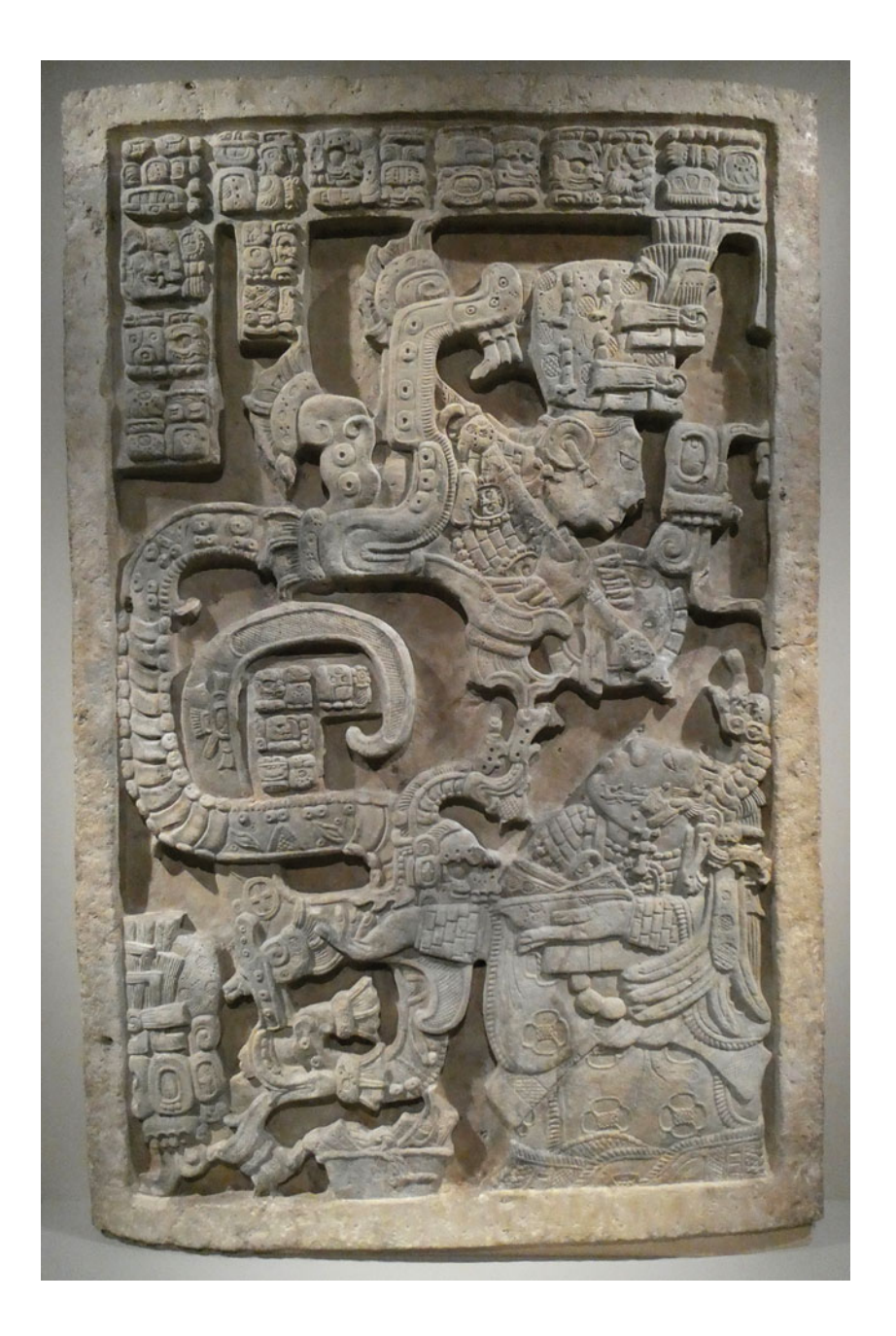
Figure 4. Lintel 25, Yaxchilán.

of the Peten Basin, and particularly Tikal. Some earlier scholarship has regarded the appearance of Initial Series calendrical notations in the area as the signal diagnostic development of the epoch. Tikal's Stela 29 incorporates the earliest known notation of this kind, 8.12.14.8.15 13 Men 3 Zip, or 6 July 292 CE (Shook 1960). However, considering Tikal's ceramic evidence, W. Coe remarked,