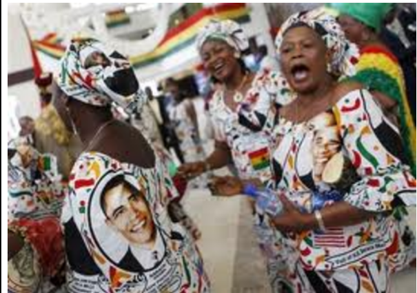
Welcome home, Obama

For Ghanaians, the continent of Africa—which is beyond nation and indigenous groups—is home to Obama. But President Obama, who grew up without having his Kenyan father around from the time he was two years old, identifies more subtly: "I have the blood of Africa within me." 7