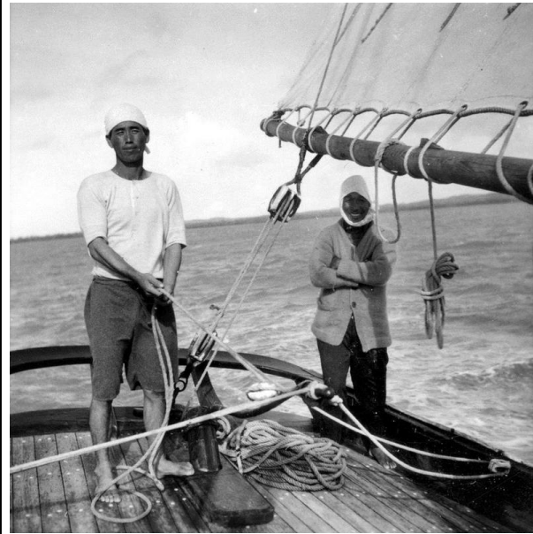
Crew of the Sedney, a pearling lugger operating off Thursday Island, off the coast of the Cape York Peninsula, Far North Queensland, Australia, 1936. The captain and most of the crew were likely from Ukui in Wakayama Prefecture, Japan.

In addition to the locally detained Japanese, civilian internment camps also came to hold Japanese who had been captured by the Dutch in the Dutch East Indies and the British and Free French governments in their colonies across the South Pacific. As the interning power, these governments had residual control over the administration of the civilian internees they had detained. This meant that the interning powers, and not Australia where the Japanese were interned, decided whether or not the internees could be repatriated. 15