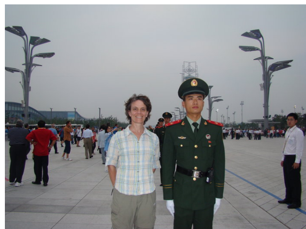
The author posing with a soldier guarding

(防暴警, literally “violence-prevention police”), had high visibility during the Olympic Games. This is a category of security personnel whose domestic numbers and functions had been expanded in 2005, at the same time that China also started sending riot police on U.N. peacekeeping missions. Clad in black, physically bigger (many are former wushu and judo athletes), and more highly trained and educated than the regular and armed police, they were brought out in large numbers to protect sensitive locations in Beijing. Their training drills were shown on CCTV in dramatic ways that promoted a positive image of them as anti-terrorist police ready to help evacuate a stadium in case of a bomb or to secure the release of innocent spectators taken hostage. The riot police are more frequently deployed to control the local populace than to deal with terrorists – indeed, on the night of the opening ceremony I watched them clear out the crowd that had gathered in the square at the central train station to watch the opening ceremony on the big-screen TV, when the security personnel decided the crowd was too big and the situation was dangerous. However, the effect of the Olympic coverage may have been similar to that described by Tagsold for the Japanese Self-Defense Forces – their image was improved by linking them with keeping the peace at the Olympics.