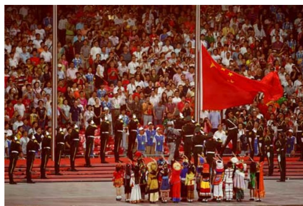
The raising of the Chinese flag in the opening ceremony.

One illustration of this point is a conversation I had with a Tsinghua University student who, as an Olympic volunteer, was standing beneath the flagpole when the Chinese flag was raised in the Olympic opening ceremony. He asked me what I thought of Beijing's Olympic education programs – didn't I find that much of it was just a “show” by the government? I told him that while many of the activities might be