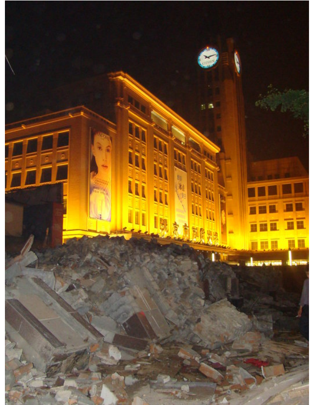
Demolition along Wangfujing Street, Beijing, May 2008

It may be that the Beijing Games will initiate a period of regular bids for Olympic Games. I was in Shanghai in November 2008, where preparations for the 2010 World Expo are ramping up now that the Olympics are over, and the mood in the municipal government is currently positive toward a future Olympic bid. However, when Chinese scholars refer to an anti-Olympics movement, they refer to opposition to the state-supported sport system and the government's neglect of popular and school sport. In 1964 Japan placed third in the gold medal count and in 1988 South Korea placed fourth, their highest placements of all time. Chinese sportspeople believed that their first place in their own Olympics might also be the peak of China's state-supported sport system, and that the pursuit of gold medals might be downgraded after the Games and more attention given to school and recreational