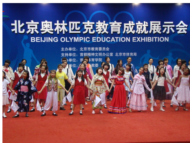
International song and dress at the Olympic Education Exhibition, May 2008.

considered to be “appearance-ism,” I thought that teaching students that their country was taking its place among other nations as an equal, and that China would no longer be “bullied” by other nations, would have an important effect on the students for the future. He was silent for a moment, and then confessed that when he saw the Chinese flag being raised in the stadium and heard the wild cheering of the crowd, he had gotten tears in his eyes, and this had been the first time in his life that this had ever happened to him. From this perspective, he agreed with my conclusion. Our conversation took place during a dinner to which I had been invited so that I could advise him on whether to accept admission to the Master's Degree programs at the University of Pennsylvania or the University of Southern California, with an eye to which city would offer better future employment opportunities.