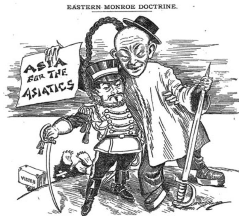
The Asian Monroe Doctrine