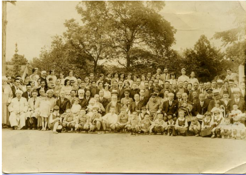
Pan-Asian gathering in Tokyo in the late 1930s (participants include Tōyama Mitsuru, a central figure in the Japanese nationalist movement, General Hayashi Senjūrō and Tatar pan-Islamist Abdurreşid Ibrahim)

The use of pan-Asian ideology to legitimize war and Japanese colonial rule discredited the movement. As a result, Pan-Asianism came to be widely identified as an ideology of colonial rule—specifically, Japan's colonial rule over Asian countries and peoples, which, the Japanese rulers insisted, was more “benevolent” than Western colonial rule because Japanese were fellow Asians. Yet, as much recent research has shown, Japanese colonial rule was as