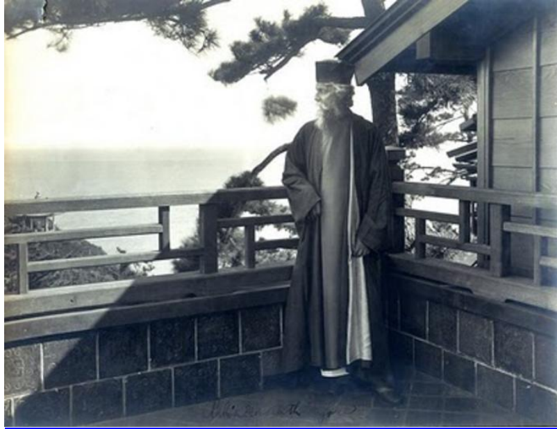
Rabindranath Tagore in Japan, 1916

South East Asians became suspicious of Japanese Pan-Asianism only in the late 1930s—much later than the Koreans and Chinese. The main reason for this was, unlike in Korea and China, the Japanese were not perceived as a threat to a region dominated by the Western powers. Consequently, Japanese-directed Pan-Asianism enjoyed great appeal throughout Southeast Asia. In the Philippines, Japanese pan-Asianists