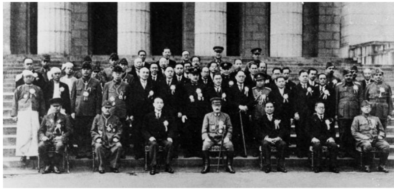
The Assembly of the Greater East Asiatic Nations, 1943, with Japanese Prime Minister General Tōjō Hideki in the center and representatives from China, Manchukuo, Thailand, India, the Philippines and Burma.

At that time even a liberal intellectual like Hasegawa Nyozeikan (1875–1969), seemingly oblivious to the looming disaster ahead, was still insisting that the “Greater East Asian War” must be the starting point for the establishment of “a united cultural sphere [by] the races of East Asia.” In similar vein, Nishida Kitarō (1870–1945), one of Japan’s leading philosophers, in 1943 characterized the war as a holy, pan-Asian struggle to liberate and unify Asia: