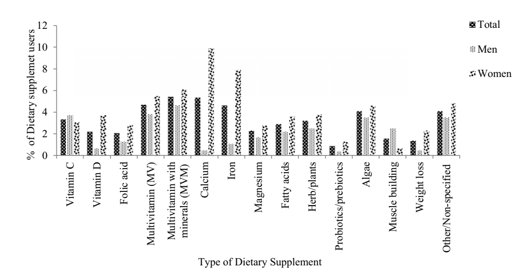
Fig. 1. Percentage (%) of dietary supplement users by type of dietary supplement and by gender in the National Health and Nutrition Survey – HYDRIA (n 4011, 1.873 males and 2.138 females).

Median for vegetable intake was estimated as 203 g/d in men and 138 g/d in women using the NCI method<sup>(11)</sup>. Non-consumers are defined as those with zero consumption.