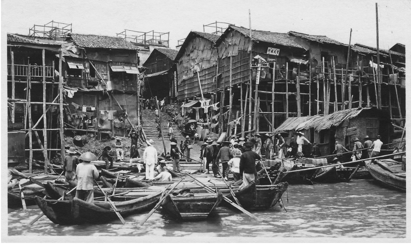
Figure 1.2. The Wuhan riverbank in the early twentieth century.

棚子 (pengzi) or low houses 矮屋 (aiwu), which offered virtually no protection from flooding. 148