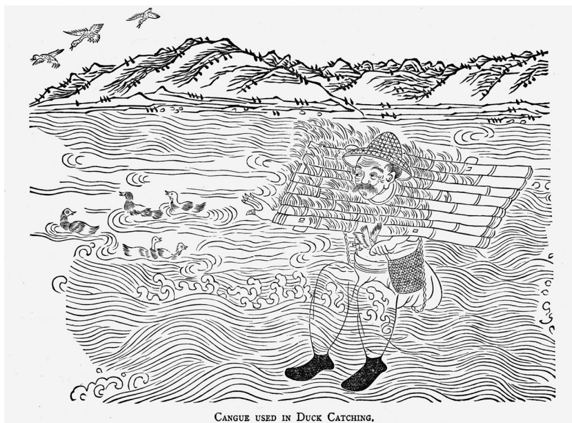
Figure 1.1. A fowler in the middle Yangtze region in the late nineteenth century. (Ayeon Kum, 'Some Chinese Methods of Shooting and Trapping Game', in With a Boat and Gun in the Yangtze Valley . Shanghai: Shanghai Mercury, 1910.)

In addition to fish, people exploited many other natural endowments of the wetlands. They foraged for edible plants such as lotus, water chestnuts and wild rice, and marketable varieties, such as duck weed, hemp and indigo. 120 They hunted terrestrial mammals such wild pigs, deer, badgers and weasels in forested upper catchments. The most important sources of wild protein, besides fish, were the eggs and meat of birds. Hunters used dragnets, bamboo cages, traps and guns to catch pheasants and snipe and a large selection of waterfowl, including geese, ducks, teal, swans, pelicans and cranes. 121 Figure 1.1 gives an impression of the innovative nature of wetland culture. Fowlers wore oilskins and camouflaged themselves with grass, before floating over to flocks of waterfowl on large