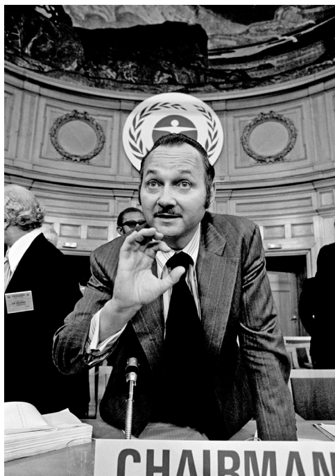
FIGURE 5.1 The recruitment of Maurice Strong in early 1970 to become Secretary General of the upcoming Stockholm Conference was a diplomatic masterstroke that would help alleviate the emerging North-South tensions that threatened the conference. Strong's personal energy and background as a businessman and head of the Canadian International Development Agency were indispensable in convincing countries of the Global South that the conference would not subordinate their development interests to environmental protection. Twenty years later, Strong would be called upon to serve in the same capacity for the 1992 Rio Earth Summit.

preparation period. He demonstrated considerable diplomatic finesse in enrolling other UN delegations in supporting the Swedish-led planning process and orchestrated negotiations surrounding another UNGA resolution, which reaffirmed the aims of the conference and provided greater structure for preparations going forward, including the creation of a twenty-seven-country Preparatory Committee. Åström's persistent engagement brought much-needed coherence to the arrangement of the Committee's critical first gathering in March 1970, which took place amid mounting uncertainty over how conference preparations should proceed. 2