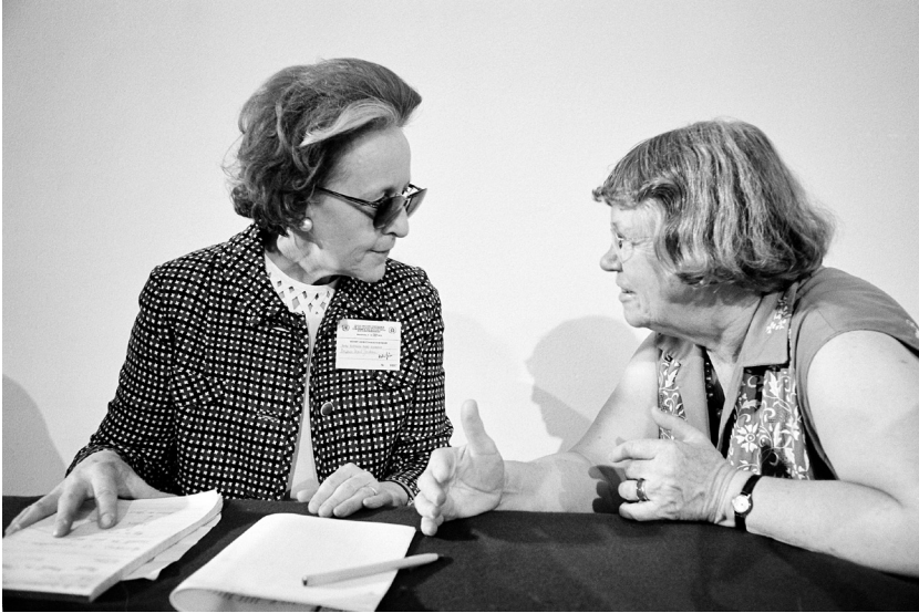
FIGURE 5.2 Economist, author, and journalist Barbara Ward (left), a globally renowned champion of international development during the 1960s and 1970s, was a moral and intellectual leader of the Stockholm Conference, co-authoring its unofficial report Only One Earth and serving as a bridge between various stakeholder groups. Cultural anthropologist Margaret Mead (right) was one of the many prominent participants of the parallel civil society Environment Forum, for which she and Ward functioned as a communication channel with the official conference.

encompassed exhibitions, films, lectures, and discussions on a wide variety of issues, such as workplace environments and supersonic transport, that were not otherwise part of the official Conference agenda. 62 These moreover included complex and controversial questions like limits to economic growth, socioeconomic justice, and the nexus of population, pollution, technology, and natural resources. This sparked heated debates between Paul Ehrlich and Barry Commoner and their respective followers as part of an ongoing feud between the two prominent