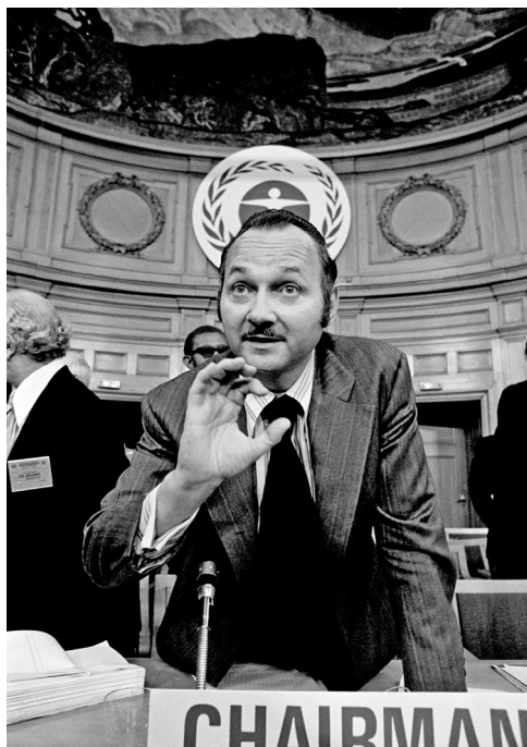
FIGURE 5.1 The recruitment of Maurice Strong in early 1970 to become Secretary General of the upcoming Stockholm Conference was a diplomatic masterstroke that would help alleviate the emerging North-South tensions that threatened the conference. Strong's personal energy and background as a businessman and head of the Canadian International Development Agency were indispensable in convincing countries of the Global South that the conference would not subordinate their development interests to environmental protection. Twenty years later, Strong would be called upon to serve in the same capacity for the 1992 Rio Earth Summit.