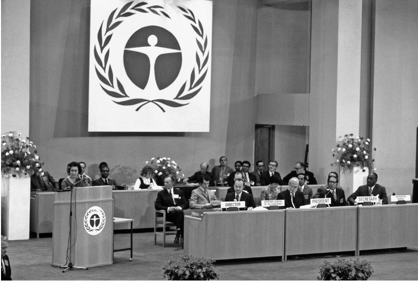
FIGURE 5.3 India's Prime Minister Indira Gandhi delivering the most celebrated speech of the Stockholm Conference in which she eloquently articulated the concerns of the Global South on the issue of the human environment and its implications for development.

The successful conclusion of the Conference with the adoption of the Stockholm Declaration on June 16 was reaffirmed six months later at the UN General Assembly in New York with Resolution 2997 of December 15, 1972, which formally established the United Nations Environment Programme and thus secured the long-term institutional legacy of Stockholm and its extensive preparation period. The resolution mandated a developing country majority in the UNEP Governing Council, consisting of sixteen seats for countries of Africa, thirteen for Asia, six for Eastern Europe, ten for Latin America, and thirteen for Western Europe and other states. Maurice Strong was appointed as the founding Executive Director of UNEP, which, in line with developing country demands, 66 and through skillful diplomatic maneuvering by Kenya's UN delegation, would be based in the Global South. 67 At a meeting of the Second Committee of the UN General Assembly in November 1972, the Kenyan capital of Nairobi was selected to host UNEP, rather