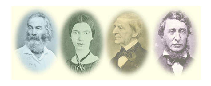
American Poets: Nineteeth Century

of 90 poets, of whom 12 are women. Half a century later, John Hollander said, in a publicity session held when the two-volume American Poetry: The Nineteenth Century (Library of America, 1994) that he edited came out (and when the volumes for the next 100 years were in preparation), that the malefemale ratio around 1800 was 8 to 1; it became 4 to 1 around 1900, 2 to 1 around 1950, and 1 to 1 thereafter.