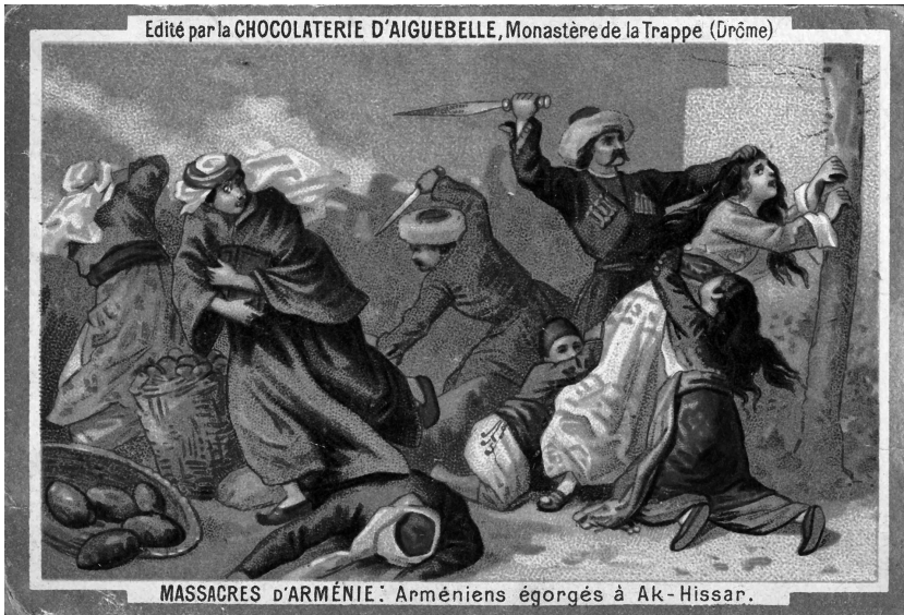
Image 1 Massacres d'Arménie: Arméniens égorgés à Ak-Hissar , c. 1895–96, by Chocolaterie d'Aiguebelle (Drôme, France). Chromolithographic chocolate card. Kislak Center for Special Collections, Rare Books and Manuscripts, University of Pennsylvania Libraries. Caption on the reverse states that the image depicts Armenians massacred by Circassians in the market at Ak-Hissar, in the Vilayet of Ismidt, on October 3, 1895.

art, French monarchs and their castles, maps of the French Empire, and so forth? 21 For the person nibbling on chocolate, and considering the cards that came in its wrappers, the images may have reinforced the notion that in the Ottoman Islamic world, outrageous sectarian violence between Muslims and Christians was common to the point of mundane. These cards, which as a “democratic art” were items that many schoolchildren collected and traded, 22 broadcast news in western Europe about grim conditions for Christian Greeks and Armenians farther east. (Certainly the D’Aiguebelle monks regarded them as vehicles for promoting a “Christian conscience” and social “catechism,” particularly among children, who were their target audience. 23 ) Like the French picture postcards of the same period, which presented studio-staged fantasy portraits of seminaked (but still head-veiled) Algerian Muslim women, these D’Aiguebelle chocolate cards advanced fantasies and stereotypes about the peoples of the “Orient.” 24 As humble as they were, the chocolate cards wielded power and contributed to the waging