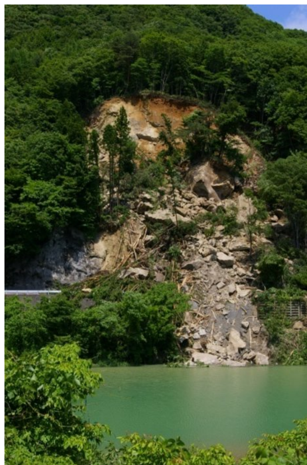
The Iwate-Miyagi Nairiku Earthquake