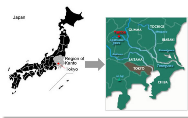
Yamba Dam map

The Transportation Ministry has designated the slopes around the reservoir site as susceptible to landslides and determined that 22 locations are likely to weaken when the reservoir is filled. In the end, however, the ministry decided to take preventive measures in just six spots “where stored water is highly likely to lead to landslides.” The region around the dam has been repeatedly subject to volcanic activity, and, as is even reported on the Transportation Ministry’s website, it is the location of a hydrothermally-altered zone. Areas that have such a zone and experience other volcanic activity are particularly vulnerable to landslides.