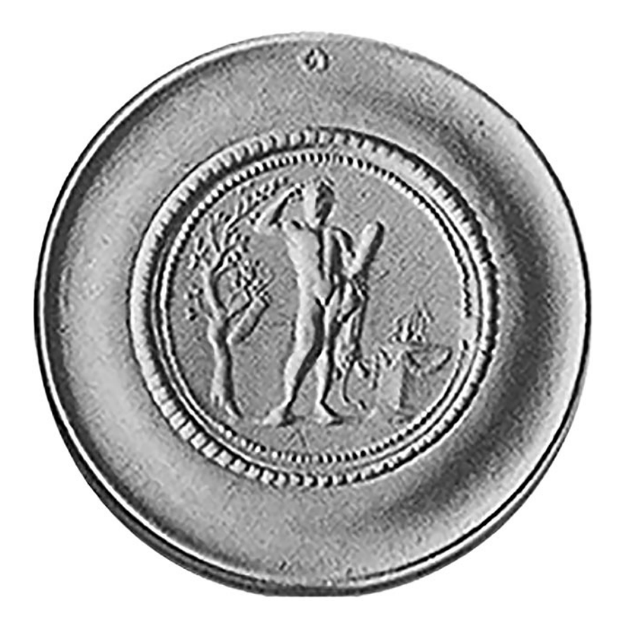
Figure 5. Hercules crowning himself at the Ara Maxima. Reverse of a bronze medallion issued by Lucius Verus (165 CE). Paris, Bibliothèque Nationale de France. Reproduced from Gnecchi (1912), pl. 77.1 (n. 25).

the Capitoline Hill,<sup>34</sup> and this Ara Maxima scene was repeated on Caracalla's coinage (198–217 CE), followed by still later numismatic examples up until about 295 CE.<sup>35</sup>