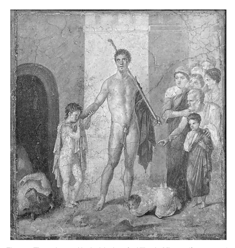
Figure 4. Theseus honoured by the Athenians after killing the Minotaur (first century CE). Wall painting from the Casa di Gavius Rufus, Pompeii. Naples, National Archaeological Museum, inv. 9043.

his left foot. The defeated Minotaur lies dead on his back on the ground behind him, his head twisted towards the viewer and his lower body disappearing into the doorway to the labyrinth. By this time, Theseus seems to have been regarded as a kind of secondary Hercules, and his club and cape in these scenes resemble familiar Herculean attributes.<sup>30</sup> This sort of scene could well have been regarded as a