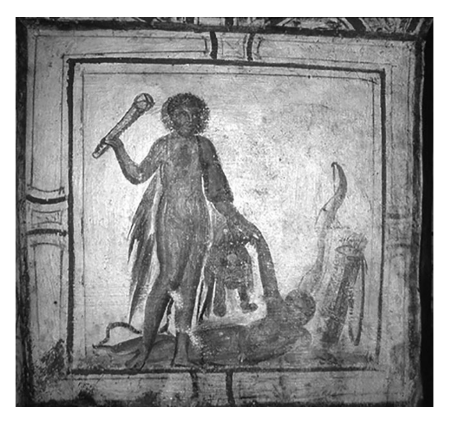
Figure 2. Hercules slaying an unknown enemy. Rome, hypogeum at Via Dino Compagni, cubiculum N, in situ (c.250-75 CE).

however, has no direct equivalent in extant Roman art and has been difficult to identify (see Figure 1C; Figure 2). In this scene, to the right of the western arcosolium, Hercules stands frontally, his weight on his left leg with his right leg bent at the knee in a slight contrapposto pose. He is bearded, has a blue halo, and his lion-skin is draped over his left shoulder and upper arm, to hang down behind him and beside his right and left legs. His club in his right hand is raised behind his head, ready to strike. Propped up to the right of the scene are his other weapons: a large bow and quiver with arrows. With his left hand, Hercules holds up the limp right arm of a naked, apparently dying man who lies stretched out on the ground at his feet. This man has yellowish skin, and, leaning on his left side, turns his head towards