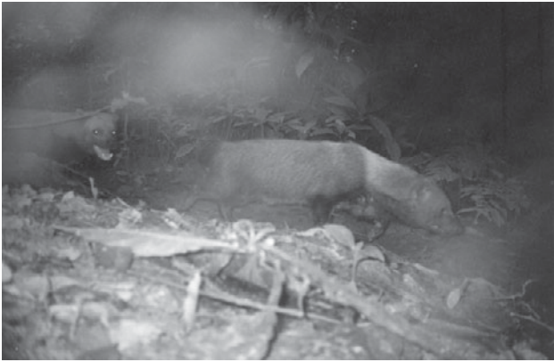
PLATE 1 Camera-trap photograph of bush dogs Speothos venaticus in Reserva Natural Morro da Mina, Paraná state, southern Brazil (Fig. 1).

adults were recorded (Plate 1) on one occasion on 6 October 2011. In all photographs the bush dogs were walking along trails. Despite our photographic records the park guards in Reserva Natural Serra do Itaquí reported no evidence of the species there. In Reserva Natural Morro da Mina two park guards reported a sighting of two bush dogs in 2004 (A. Gonçalves & A. Pinheiro, pers. comm.). In Reserva Natural Salto Morato we did not obtain confirmation by camera trapping that the bush dog is present, although a guard observed the species there in 2000 (P. Moraes-Filho, pers. comm.).