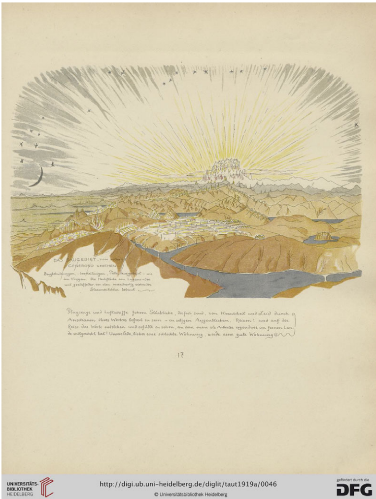
Figure 5.6 Alpine Architecture: An outlandish utopia by Bruno Taut