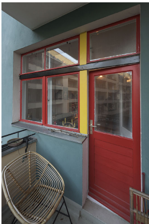
Figure 5.3 Colourful loggias at Carl Legien Estate

Taut's smart design was geared towards quality of life. Every apartment has a loggia (a roofed balcony) that extends the living space in summer. The smallest apartments have the biggest loggias. Every loggia has built-in storage that doubles as a fridge in winter, when people stock up for Christmas.