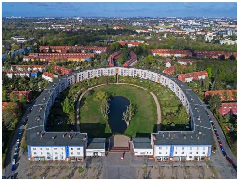
Figure 5.4 Bruno Taut's Horseshoe Estate in Berlin-Britz built by GEHAG. The estate is listed as a UNESCO World Heritage Site. Currently, it is owned by Deutsche Wohnen.