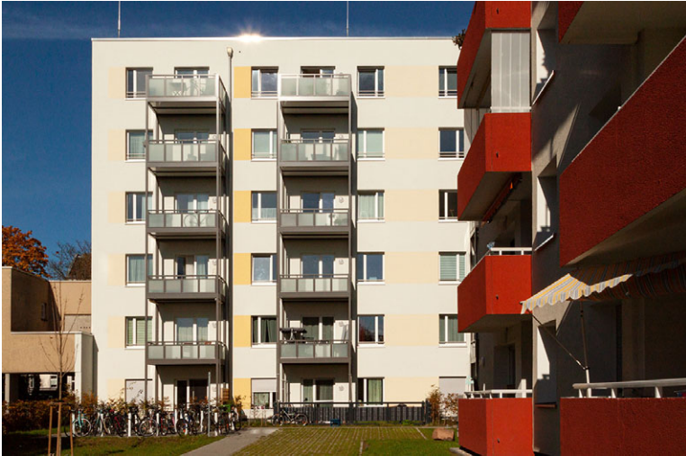
Figure 5.5 ‘Architecture of financialisation’: A housing project by Vonovia in Alt-Tempelhof, completed in 2021

After Marienufer, Kockelkorn visited an unnamed housing project in Alt-Tempelhof, completed by Vonovia in 2021. From what she describes, no one can criticise it as being too nice for the working classes. To begin with, the working classes can’t afford it: the rent of €12 per square metre is the maximum legally allowed in this area. Secondly, it is not nice: Kockelkorn found that ‘the simple shape, rough aesthetics and cost-saving construction processes are reminiscent of the minimum standard design of emergency shelters’ 4 (Figure 5.5).