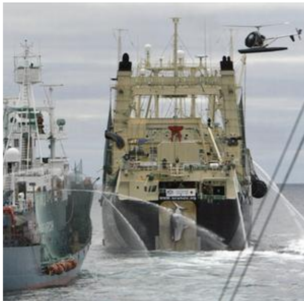
On February 6, 2009 a Japanese factory ship the Nishin Maru pulled in a Minke whale.

Under the terms of the research, the Japanese government orders the catching (and killing) of a large number of whales. This is to determine the population size, to generate more accurate statistics, and to collect earwax, which is used to determine the age of whales. But Japan's fleet mainly catches minke whales, which are common, and if the research can be done without killing whales the fleet will do so.