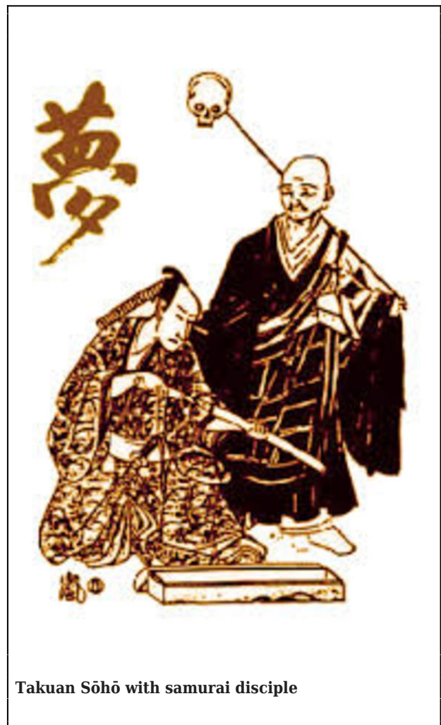
Takuan Sōhō with samurai disciple

Shōsan (1579-1655) who urged his disciples to develop a warrior's fortitude. Both of these latter Zen masters had earlier been samurai and entered the priesthood only after retirement, i.e., upon reaching an age when they were no longer fit for battle.