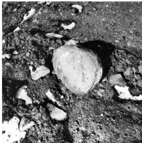
Figure 3. Lawrence Weiner, THE ARCTIC CIRCLE SHATTERED , 1969, sponsored by the Edmonton Art Gallery, Alberta, Canada, for the exhibition Place and Process – Arctic Trip , 1969. © 2021 Lawrence Weiner / DACS, London.