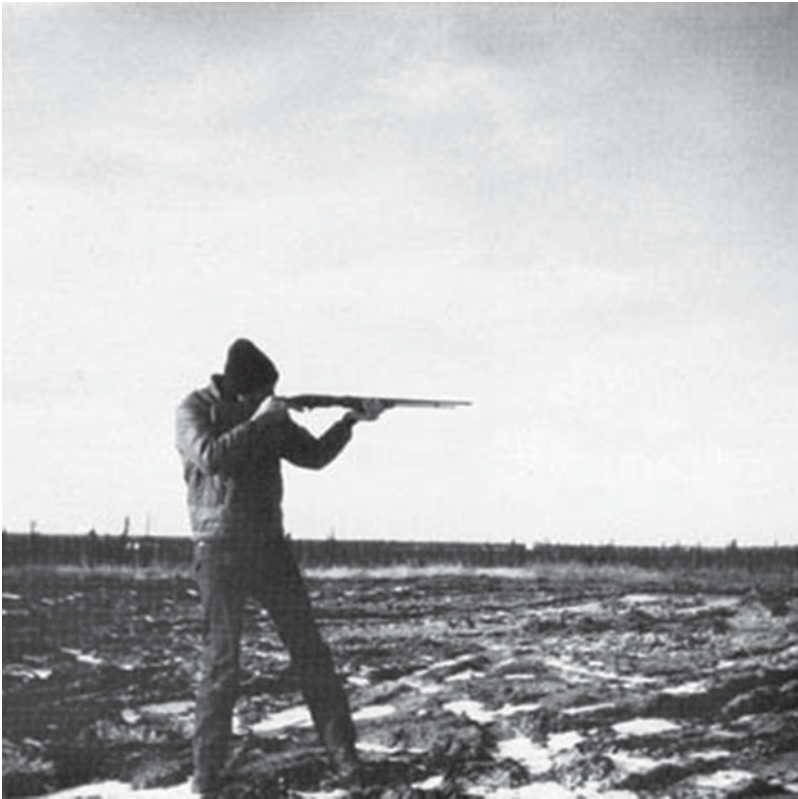
Figure 2. Lawrence Weiner, THE ARCTIC CIRCLE SHATTERED , 1969, sponsored by the Edmonton Art Gallery, Alberta, Canada, for the exhibition Place and Process – Arctic Trip , 1969. © 2021 Lawrence Weiner / DACS, London.