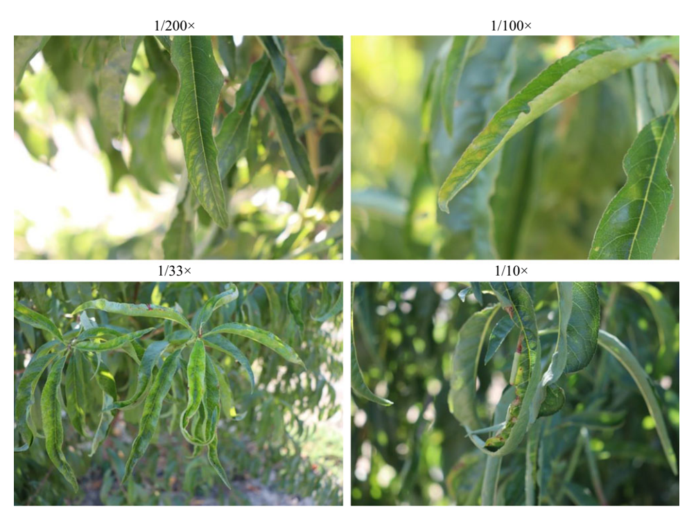
Figure 3. Chlorosis, epinasty, and necrosis symptoms on peach 28 d after treatment with florpyrauxifen-benzyl at 1/200 \times , 1/100 \times , 1/33 \times , and 1/10 \times simulated drift rates. The use rate of florpyrauxifen-benzyl on rice is 29.4 g ai ha<sup>-1</sup>. Photos were taken June 28, 2021, in the 2-yr exposure study.

Grapevines treated with 1/33× and 1/10× florpyrauxifenbenzyl and 1/33× triclopyr rates 2 yr in a row had up to approximately 50% yield reduction (Table 4) compared with the NTC. Yield was 22.1 kg vine<sup>-1</sup> in the 1-yr exposure study and 19.3 kg vine<sup>-1</sup> in the 2-yr exposure study. However, the grape yield from plots treated with 1/200× and 1/100× drift rates of both florpyrauxifen-benzyl and triclopyr was not different from that of the NTC. Furthermore, grape sugar content tended to increase as florpyrauxifen-benzyl and triclopyr fractional drift rates increased (Table 4), but it was different from the NTC only with the 1/10× rate of florpyrauxifen-benzyl in the 1-yr exposure study, florpyrauxifen-benzyl at the 1/33× and 1/10× rates, and triclopyr at the 1/33× rate in the 2-yr exposure study. The highest florpyrauxifen-benzyl rate increased °Brix up to ~20% compared with NTC vines that were ~20°Brix at harvest. The higher sugar content with greater herbicide rates were similar in previous research (Haring et al. 2022).