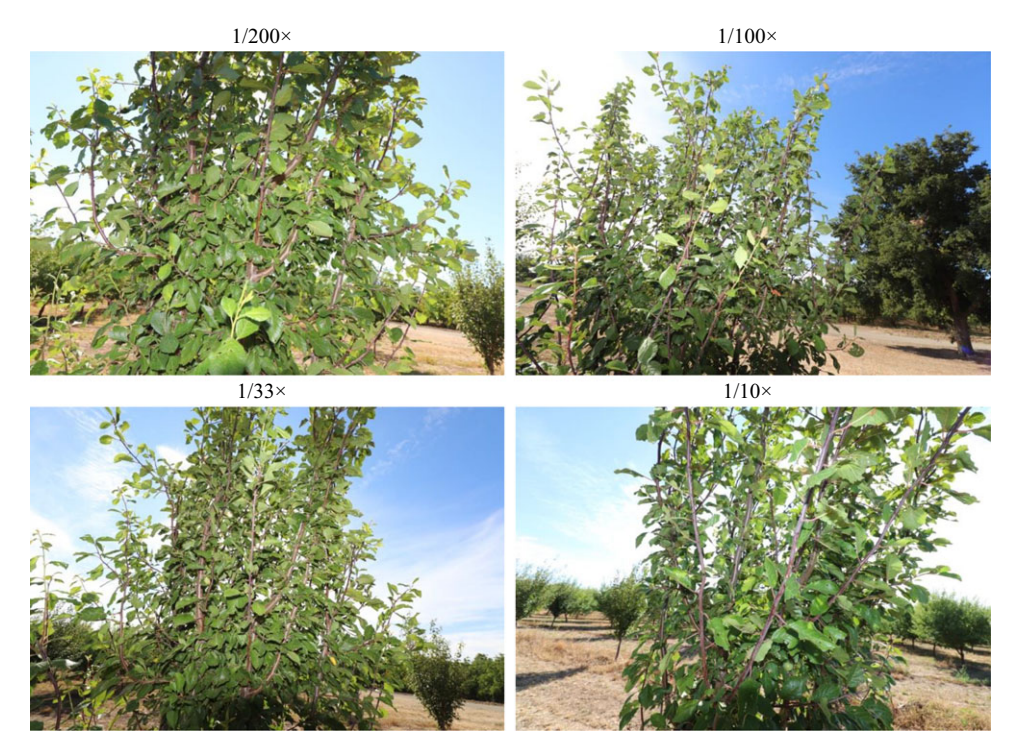
Figure 4. Chlorosis, epinasty, and stem curling symptoms on plum 28 d after treatment with florpyrauxifen-benzyl at 1/200×, 1/100×, 1/33×, and 1/10× simulated drift rates. The use rate of florpyrauxifen-benzyl on rice is 29.4 g ai ha<sup>-1</sup>. Photos were taken June 28, 2021, in the 2-yr exposure study.

of florpyrauxifen-benzyl and triclopyr. However, florpyrauxifen-benzyl and triclopyr drift at the 1/33× and greater rates may result in significant yield reduction despite of foliage recovery from the initial injury symptoms. This simulated drift research was conducted using a constant spray volume and variable rates, which is different from actual drift scenarios in which both concentration and volume change as herbicides move off-target. Other researchers have suggested droplet concentration can dramatically affect crop injury (Banks and Schroeder 2002); however, understanding the relative sensitivity of the three fruit crops species grown in proximity to California rice fields is highly relevant to stewardship of florpyrauxifen-benzyl in the Sacramento Valley.