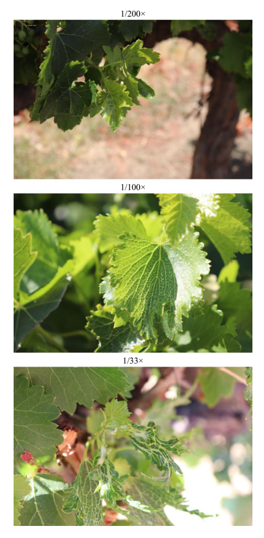
Figure 2. Chlorosis, epinasty, leaf crinkling, leaf narrowing and twisting symptoms 28 d after treatment with triclopyr at 1/200×, 1/100×, and 1/33× simulated drift rates. The use of triclopyr on rice is 420.3 g ae ha<sup>-1</sup>. Photos were taken June 28, 2021, in the 2-yr exposure study.