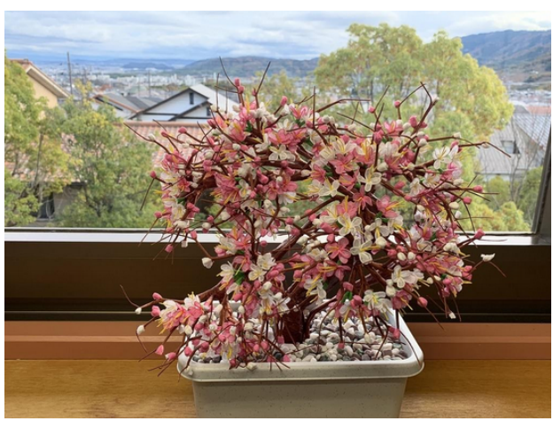
Paper flowers made by Kita.