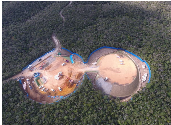
Landing zones under construction November 2016.

Meanwhile, since 1957, when 7,800 ha (19,274 acres) of the Yanbaru forest was taken over by the U.S. military and converted into the U.S. military's Northern Training Area, the U.S. military has been conducting jungle warfare training and low flying training of aircraft there. There are 22 (plus 2 newly constructed) landing zones for military aircraft and other training facilities in the NTA. Loud noise emitted from aircraft, land contamination from disposed materials and crashed aircraft, combined with logging and construction of logging roads by local forest industry, have presented and continue to present significant environmental challenges to the Yanbaru forest. The current construction of landing zones now adds to those challenges.