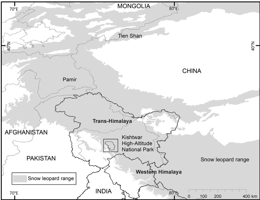
FIG. 2 The location of Kishtwar High Altitude National Park, and with respect to the global snow leopard distribution.

During reconnaissance surveys, trail monitoring and camera trapping we also recorded the presence of ungulates such as the Siberian ibex and Himalayan musk deer, which have been reported previously in this area (Kichloo et al., 2023), and small mammals, including the long-tailed marmot Marmota caudata and pika Ochotona sp. These species are considered potential snow leopard prey (Lyngdoh et al., 2014). Of these, the highest camera-trap capture rate was of the Siberian ibex (Table 1). We also recorded other carnivore species with the camera traps (Himalayan brown bear Ursus arctos , Asian black bear Ursus thibetanus , red fox Vulpes vulpes , leopard cat Prionailurus bengalensis , yellow-throated