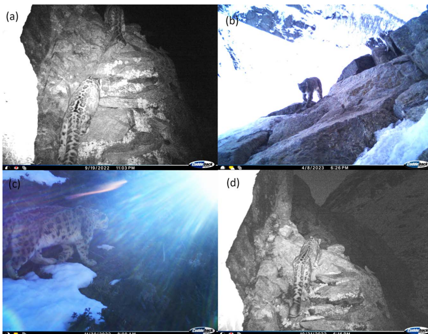
PLATE 1 Camera-trap photographic records of the snow leopard Panthera uncia in Kishtwar High Altitude National Park, Jammu and Kashmir, India; (a) is the first camera-trap record, on 19 September 2022, with two individuals.

During 6,623 trap-nights we obtained photographs of two individual snow leopards in a single frame on 19 September 2022 at 23.03 in the Kiyar catchment of the Dacchan range at 3,280 m. This was the first photographic evidence of the species in Kishtwar High Altitude National