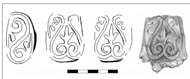
Fig. 5. The distinctive 'floral' amphora handle decorations. From left: a stylistically similar motif found during excavations at Nokalakevi in 1981; decorated amphora handles recovered from Khuntsi in 2015 and 2016; illustration of the 2016 example by S. Laitadze.

To date, seven samples of charcoal from burnt deposits have been collected and submitted for radiocarbon dating (table 3). All radiocarbon ages, including those derived from bone (below), were calibrated using the Oxford Radiocarbon Accelerator Unit calibration program OxCal 4 (Bronk Ramsey 2017), against the IntCal13 atmospheric calibration curve (Reimer et al. 2013). Calibrated date ranges are identified as cal. BC or cal. AD. Three samples, collected in 2007, were from a substantial deposit of burnt daub in Trench A (context 216), overlying the wall base of a small square structure. With all three samples taken from the burnt remnants of a single post, a chi-square test of the results led to one being excluded and the remaining two combined and processed to produce a single calibrated date range. Three further charcoal samples were taken from Trench F in 2016, one from a layer of burnt material (context 102) underlying a similar line of unbonded