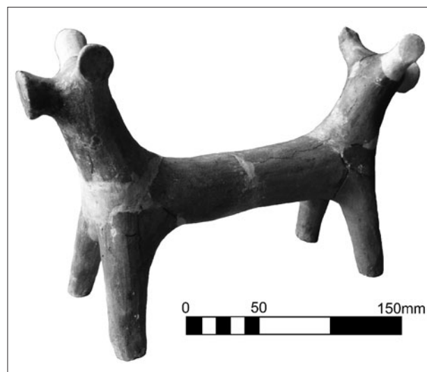
Fig. 4. An example of the double-headed zoomorphic figurines found at Nokalakevi.

Five ceramic samples were taken for OSL dating from Trench C during excavations in 2014 and 2015 (table 2). The first three were retrieved from a colluvial deposit (Trench C context 113) and were sampled in order to obtain absolute dates for the extent of the mixing of material from further up the slope. The scale of colluvial movement of sediment has been long observed at Nokalakevi, with significant deposits representing periods of different depositional characteristics. Bands of sediment with a higher density of fine limestone pebbles are interspersed with bands containing very few inclusions and bands with significant quantities of angular limestone