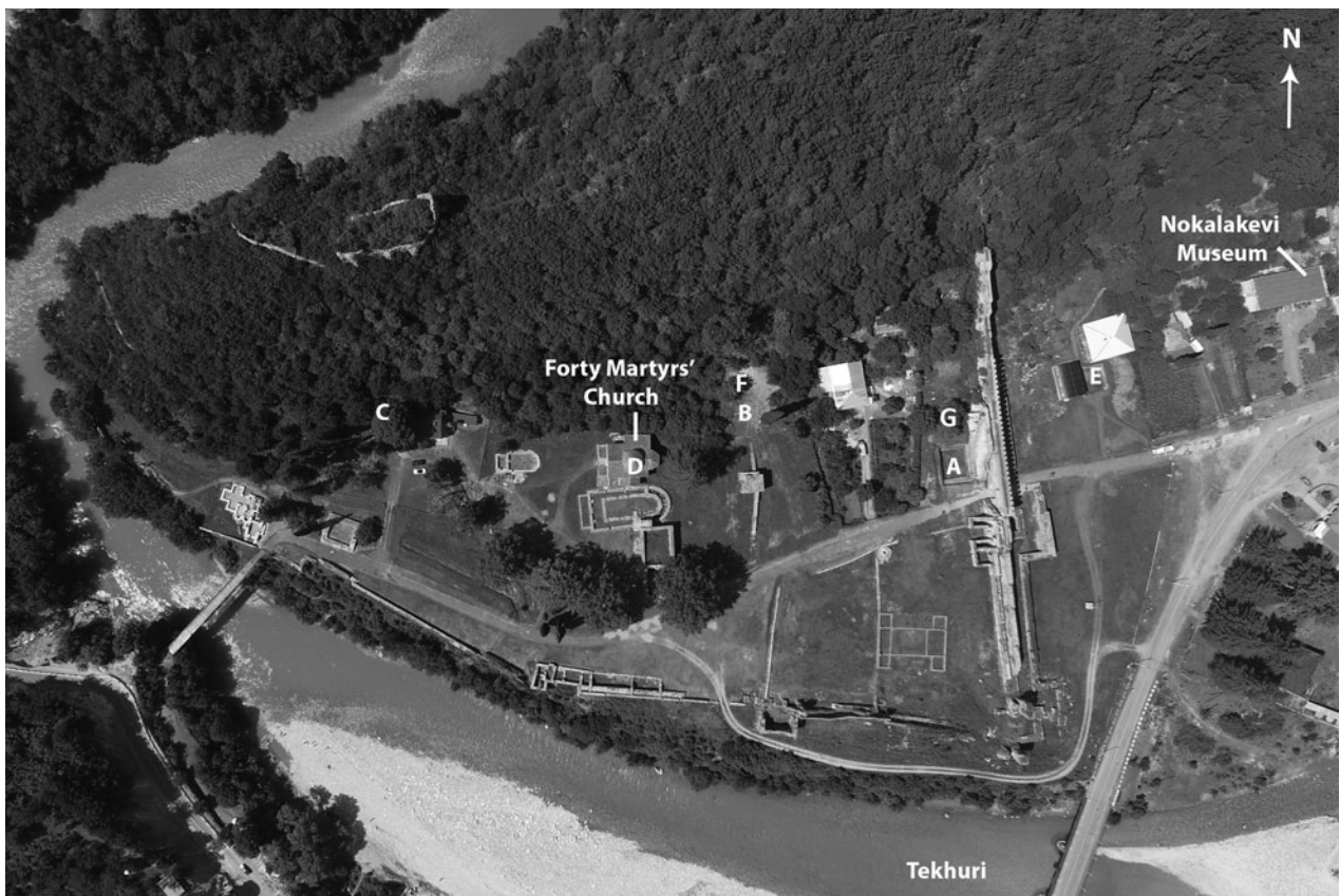
Fig. 3. Aerial view of the lower town at Nokalakevi, showing the positions of the trenches (A to G) excavated by the Anglo-Georgian Expedition since 2001.

Since 2013, 14 ceramic samples have been submitted for OSL dating (tables 1 and 2). The initial motivation was to get an indication of dates for the earliest archaeological deposits, within which no organic material was present; however, the programme was expanded to test the existing ceramic chronologies and to examine the extent of mixing within colluvial material. More commonly used in the dating of buried sediments, OSL results are based on the measurement of trapped charge released from mineral grains when external stimulus, in the form of light, is applied to sand-sized quartz (60–255 \mu\text{m} ) extracted from the inside of the sherds (Aitken 1998). Analysis of the results provides a date when the pot was fired, at which point the ‘traps’ were zeroed by the application of heat. Following this event, the mineral grains gradually gained charge through exposure to the radiation flux from naturally occurring radionuclides within the clay matrix and the surrounding sediment. In the absence of organic material, the technique provides a useful alternative to