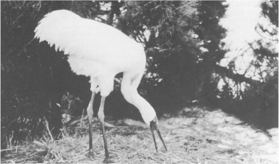
A Siberian crane at its nest.

Pakistan, and hunters here were probably the chief cause of the flock's 60 per cent decline in the decade up to 1983. In Pakistan live-crane catching, particularly of the demoiselle and common crane, has long been a major activity in the Northwest Frontier Province and in part of Baluchistan. In 1984, however, crane-hunting laws were passed that, among other things, prohibited the sale of cranes (much to the hunters' outrage), and an educational back-up has followed in local and regional dialects, which includes an audio-visual programme to teach hunters how to distinguish the Siberian white crane from its far more numerous common and demoiselle crane cousins.