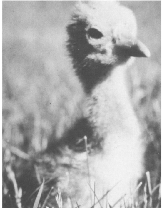
Dushenka, the first Siberian crane to be hatched in captivity (G. Archibald).

Baraboo, with a captive flock of 19 in 1986, now hatches some eggs, raising the chicks, and flies other eggs back to the Oka reserve where a second captive flock of 15 is being built up with eggs from the tundra. Says Archibald: 'If they can learn how to breed them in captivity as we're doing here, they can just transfer eggs out of their