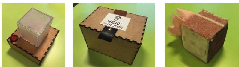
Figure 5: Low fidelity prototypes (Left: light effect; Middle: sound. Right: tactility)

Based on the updated design specification, the team began an ideation phase to explore new solutions for mobile sensor stimulation in one-to-one situations. The students wanted to test which kind of stimulation that would ease the residents the most in conflicting situations. They found inspiration in literature on cognitive stimulation and they translated stimulation into sound, light and tactility, and developed three low fidelity prototypes (see Figure 5).