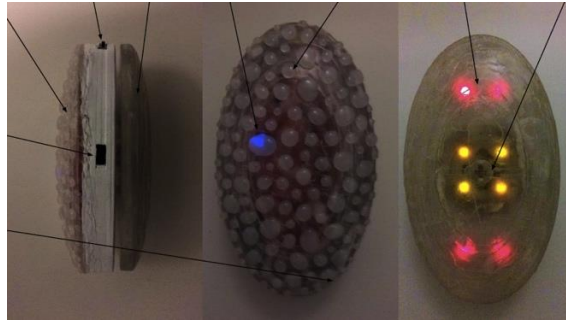
Figure 7: The final prototype used in the final intervention

as the negotiated overall concern of the project. It required programming of lights and sound as well as selection of materials which can be seen as a negotiation with the technology in terms of what was possible to prototype. With a functioning prototype ready, the design team staged one final intervention at the nursing home. The intervention was carried out over a period of two weeks, in which the earlier appointed prototype ambassadors again was given the responsibility of testing the prototype to see whether it had a positive influence on the residents.