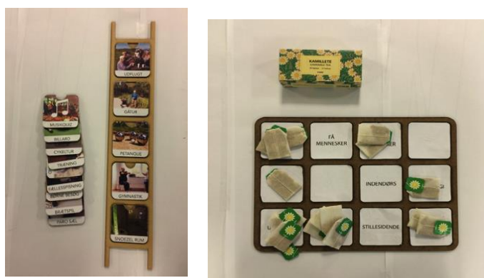
Figure 1: Illustration of the first design game

The dialogue was staged in the activity centre of the nursing home, and after having tried to engage 4 residents in a dialogue, the design team realised the materiality assumed a higher abstraction level, than the residents was able to engage in. The residents simply did not know what to do and just stared at the design team, while others wandered away. Thus, the design game did not succeed in acting as an intermediary object between the residents and the team. However, an important learning from these interactions was, that the team needed to come up with another approach to engage this particular group of actors. Since it was important for the team to engage with the residents to understand their concerns and motivations, they decided to stage a new dialogue based on a different design game. With basis in the same pieces as in the first dialogue, the team engaged the residents in a dialogue about the pictures and asked them to assign a smiling or angry smiley to each activity in accordance to whether they liked it or not (see Figure 2).