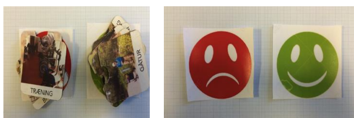
Figure 2: Illustration of the second and modified design game

The dialogue was staged in the activity centre of the nursing home, and after having tried to engage 4 residents in a dialogue, the design team realised the materiality assumed a higher abstraction level, than the residents was able to engage in. The residents simply did not know what to do and just stared at the design team, while others wandered away. Thus, the design game did not succeed in acting as an intermediary object between the residents and the team. However, an important learning from these interactions was, that the team needed to come up with another approach to engage this particular group of actors. Since it was important for the team to engage with the residents to understand their concerns and motivations, they decided to stage a new dialogue based on a different design game. With basis in the same pieces as in the first dialogue, the team engaged the residents in a dialogue about the pictures and asked them to assign a smiling or angry smiley to each activity in accordance to whether they liked it or not (see Figure 2).