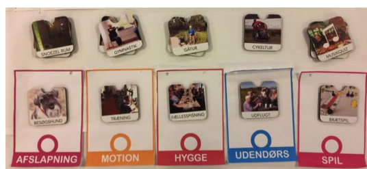
Figure 3: Illustration of the third and yet again modified design game (Note: 'Afslapning' = Relaxation, 'Motion' = Fitness, 'Hygge' = Cosiness, 'Udendørs' = Outdoor and 'Spil' = Gaming)

Again, it was difficult to keep the residents focused in the dialogue, and the pictures and smileys again appeared to be too abstract for the residents to relate to. Furthermore, the dialogues once again took place in the 'activity centre' where most residents walk in and out, watch television, or do various activities. The team designed yet another design game providing structure and an element of choice (see Figure 3). Furthermore, the dialogue was staged in another setting, e.g. the resident's own apartments, providing comfort and tranquillity.