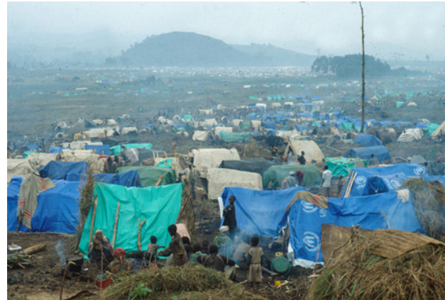
Refugee camp in Zaire

the Convention with apparent impunity. The UN itself has estimated that, during 1996–97, two hundred thousand Rwandan refugees were killed in Zaire. [16]