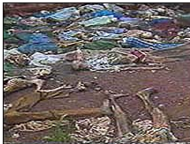
Victims of Rwandan massacre

of up to 800,000 predominantly Tutsi civilians in Rwanda. One million mainly Hutu refugees moved into what was then Zaire in 1994, and UNHCR immediately appealed for military help. French troops were there from the start, shortly followed by US Army logistical support—Operation Support Hope—then Swedish and German troops, and the Japanese Self-Defence Force (a minor breakthrough in Japan's remilitarization, which Ogata celebrates). Setting up and running the camps required the support of Mobutu's regime, which he gave with a view to strengthening his hand in the region and in international negotiations. [7] Ogata argued that 'From the outset it seemed obvious that return was the main solution. The refugee outflow was too massive for the people to be absorbed by neighbouring countries or to be resettled in third countries.' [8] This policy was now becoming so entrenched that it no longer seemed necessary for UNHCR even to ask whether repatriation was in the best interests of the refugees. Sporadic massacres of displaced civilians within Rwanda seem only to have slightly delayed the apparently inevitable return.