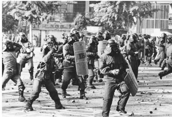
Police at Kwangju