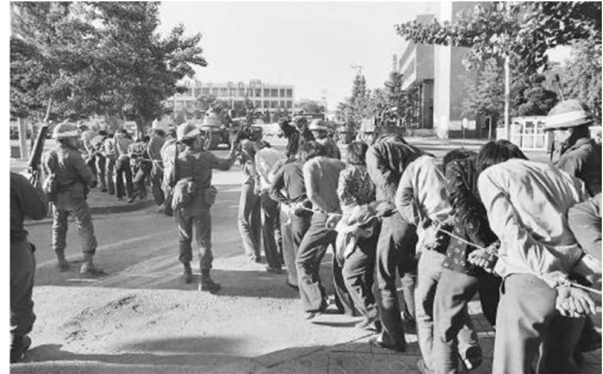
South Korean police arrest protestors during the Kwangju incident in 1980

Sweeping under the rug the tyrannical aspects of Park's rule, modernization theorists in Washington considered U.S. policy in South Korea to be a phenomenal success because of the scale of economic growth, which was contingent in part on manufacturing vital equipment for the American army in Vietnam. The United States was especially grateful to Park for sending 312,000 ROK soldiers to Vietnam, where they committed dozens of My Lai-style massacres and, according to a RAND Corporation study, burned, destroyed, and killed anyone who stood in their path. 85 The participation of police in domestic surveillance and acts of state terrorism was justified as creating a climate of stability, allowing for economic "take-off." Together with Japan, South Korea helped crystallize the view that a nation's police force was the critical factor needed to provide for its internal defense. 86