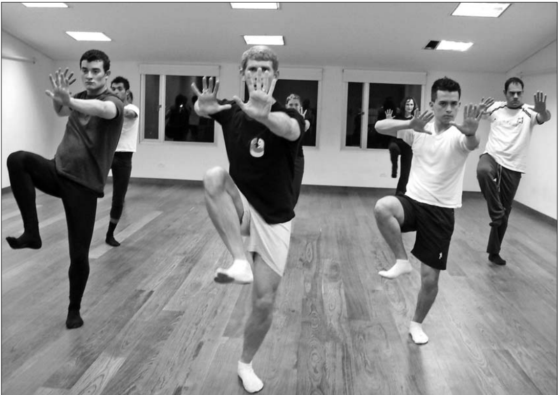
A training workshop in the Suzuki method.

been used in comedies, opera, gay and lesbian performance, and single-sex troupes. Exceptions – that is, serious gender transformations – have generally been limited to females in male roles. Examples include Sarah Bernhardt as Hamlet, Linda Hunt as Billy Kwan in The Year of Living Dangerously , Tilda Swinton as Orlando, or Cate Blanchett performing the Bob Dylan-like Jude Quinn in I'm Not There . There are also rare males who play non-camp female roles, such as Quentin Crisp as Elizabeth I in Orlando . However, Crisp was a well-known, outspoken, and outrageous gay performer, and various novels and plays question Elizabeth's actual gender (and identity) – even Tamasa-burō has portrayed the Virgin Queen as a male in drag (in Contradanza , or Elizabeth ). 5