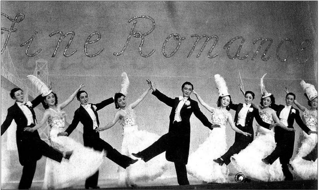
The Takarazuka Revue in (above) the 1947 production of A Fine Romance and (below) the 2012 musical Footloose .