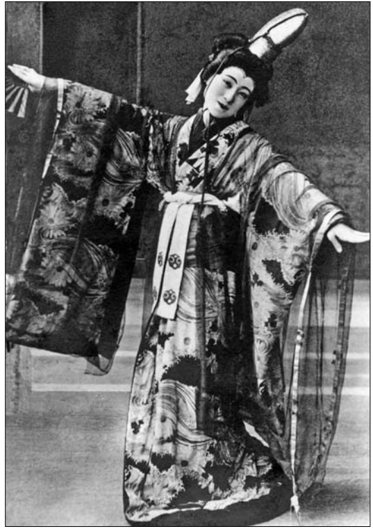
For Western men, the ideal woman is a Japanese woman. Kawakami Sadayakko in Geisha to samurai (The Geisha and the Knight) , Paris, 1900.